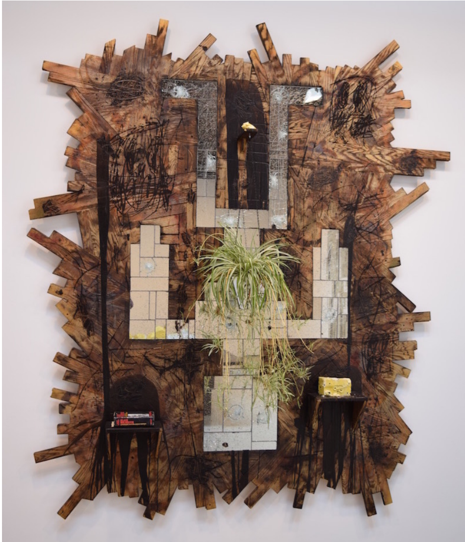
Rashid Johnson Falling Man , 2015 293.4 x 261.6 x 65.4 cm