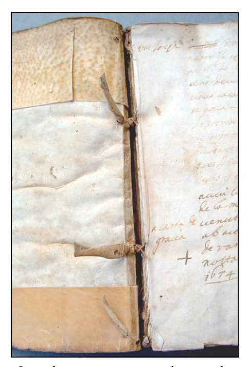
Laced-in sewing on single raised sewing supports

Like any book, limp vellum bindings have the basic structural elements of covering material, textblock, and textblock to cover attachment. Other exterior elements include rigid backplates, tacketing, protective