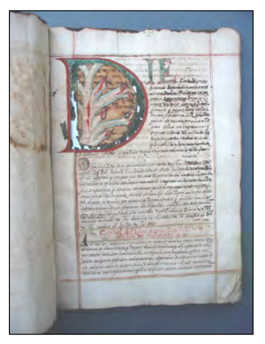
Degradation of the copper-based verdigris

environment, the condition of this media on archival materials is surprisingly good. In addition to iron gall ink, carbon black ink is another media found on paper and parchment materials. A potential project for future teams is an examination of the pigments used on the parchments and on paper in the limp vellum bindings. While the media in the limp vellum books have been protected from light and other deleterious effects, as you can see here from the degradation of the copper-based green verdigris in this fifteenth century binding, some pigments have inherent problems.