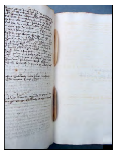
Parchment stays protect paper.

To hold turn-ins in place without adhesives, the vellum was frequently tacked at the fore-edge corner with either twine or thin alum tawed leather strips. Limp vellum bindings in this collection are frequently without turn-ins. The variety of fasteners and ties in the collection is fascinating. Of particular note are the toggle fasteners which are tightly rolled vellum or alum tawed leather that connect to a