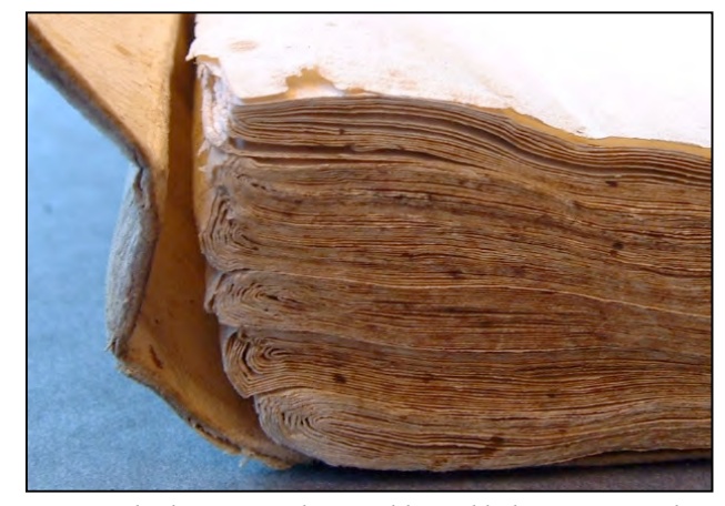
Thick sections that could quickly be sewn together.

Vilassar dates to approximately 1340. Limp vellum bindings were used most popularly as account books from their inception until the mid 1600s when stiff or semi-stiff vellum bindings became popular as account books increased in size. Printed books also were often sold in limp vellum covers in the sixteenth and seventeenth century as an economical alternative to leather bindings. While this use of limp vellum on printed books decreased in popularity in the eighteenth century,