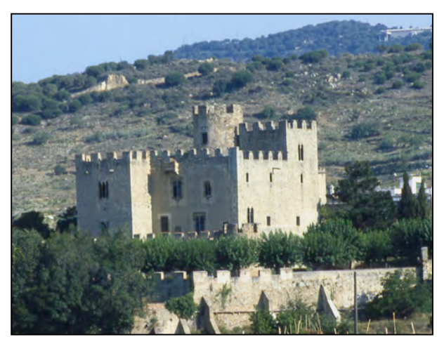
Castillo de Vilassar de Dalt.

The Castillo de Vilassar de Dalt occupies a strategic position in foothills above the village of the same name, overlooking the Mediterranean just twenty-six kilometers northeast of Barcelona, Spain. The central tower of this castle fortress was constructed in the 11<sup>th</sup> century and served as a defensive structure guarding against invasion and pirates attacks. Over the course of the next few centuries, it evolved through form and function into a noble mansion, passing by inheritance through several aristocratic families. In the mid