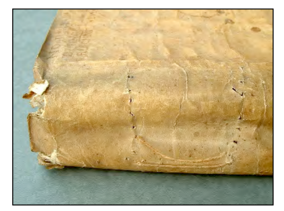
Broken sewing and torn vellum, typical of long stich sewing without backplates.

Although quite simple and quick, the long stitch style of sewing is not without its problems. Thread or