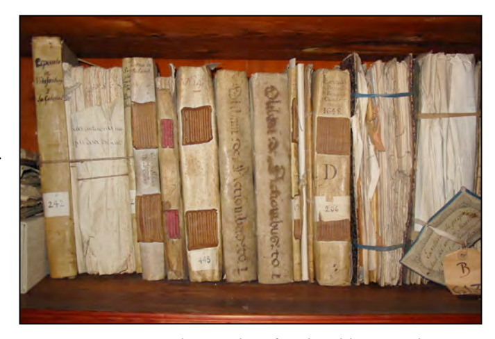
Several examples of archival long stitch sewing.

The second sewing structure is more predominant in the archive at Vilassar. Long stitch archival sewing is a very straightforward and fast style of sewing that creates a mechanical tightback attachment of the text to the covering material. The archival long stitch sewing structure has continuous sewing between the stations linking each section either independently or to one another as well as to the yellum cover.