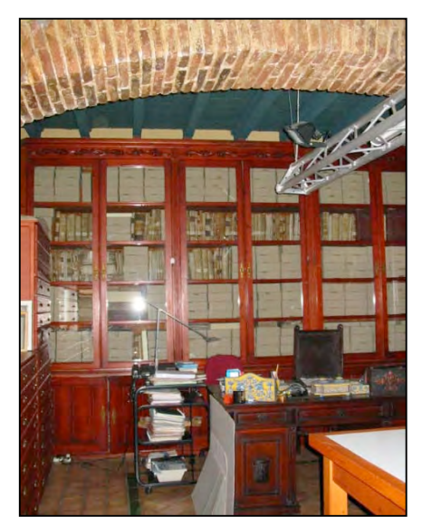
Castle archives, 2004

My former instructor, Karen, flew to Spain to re-assess the project. Earlier teams had successfully re-housed the bound volumes with bookshoes, phase boxes and drop spine boxes. Most of the flattened parchment documents had been tied between boards and placed in flat files built specifically for their storage. Most of the paper documents, however, were still tied in bundles or in the red metal boxes and there were nearly 1,500 stiffly folded parchments that were impossible to open or read.