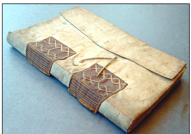
Top: Recycled parchment manuscript Bottom: Envelope flap

As mentioned earlier, limp vellum bindings were ideal blank books because their flat opening allowed an ease of writing. These books unfortunately were difficult to keep closed, so in addition to fasteners, ties of vellum, linen, silk, and alum tawed leather were frequently employed. A protruding flap at the fore-edge helps protect the textblock pages. Alongside fasteners and ties, the prevalence of fore-edge flaps demonstrates that these bindings contained important materials. A variance on the fore-edge flap is the envelope flap, an Islamic influenced element. Both the envelope flap and the square fore-edge flap are related to the more subtle bent edge or yapp.