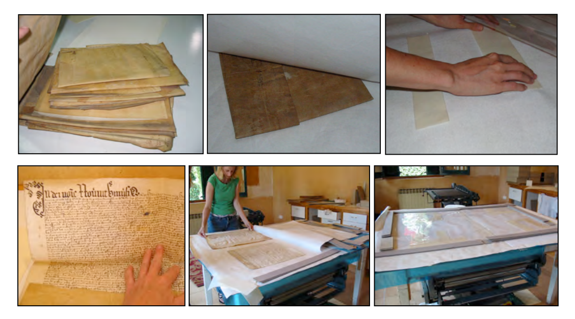
Folded parchments were found throughout the collection. To open the parchments for research access, the parchment is placed between gore-tex and tyvek then damp blotters introduce humidity locally. The parchment is unfolded gradually, and scrap board is used to seal a simple humidification chamber. The parchments will then be dried and flattened under weight.

proves both flexible and efficient, and thus far over 600 parchments have been flattened. Special enclosures are created for wax seals and their metal containers.