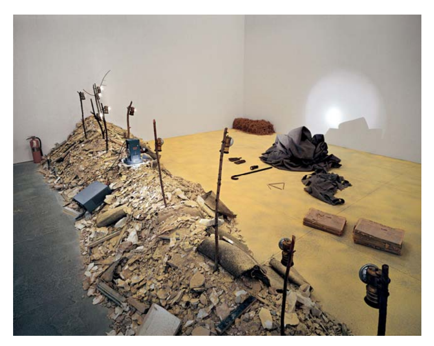
Figure 1 Joseph Beuys Aus Berlin: Neue.

Aus Berlin: Neues vomKojoten, 1979 Dia: Beacon, Beacon, New York