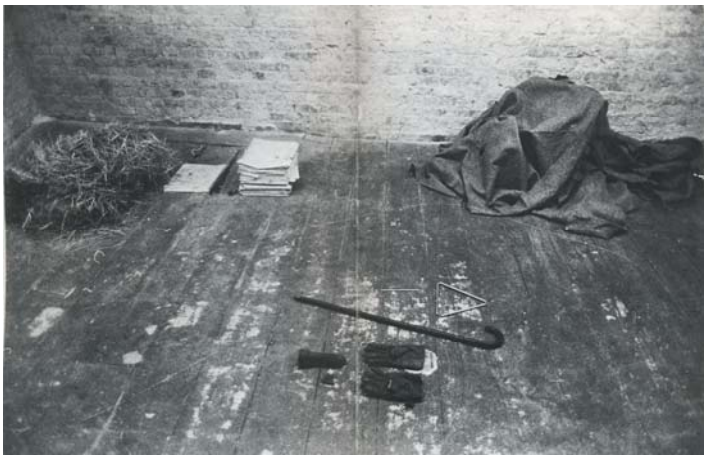
Figure 6 Joseph Beuys-Ja, jetzt brechen wir hier den Scheiss ab-Coyote II. 1979 Joseph Beuvs René Block Gallery, Berlin

The second performance that comprises the installation dates from September 15, 1979 (figure 6) when the Galerie René Block in Berlin closed its doors. Just prior to its closing, the final exhibition by Beuys took place in its rooms. Among the sculptures shown were the remnants of I Like America and America Likes Me. A small tome was published on the occasion of the closure: