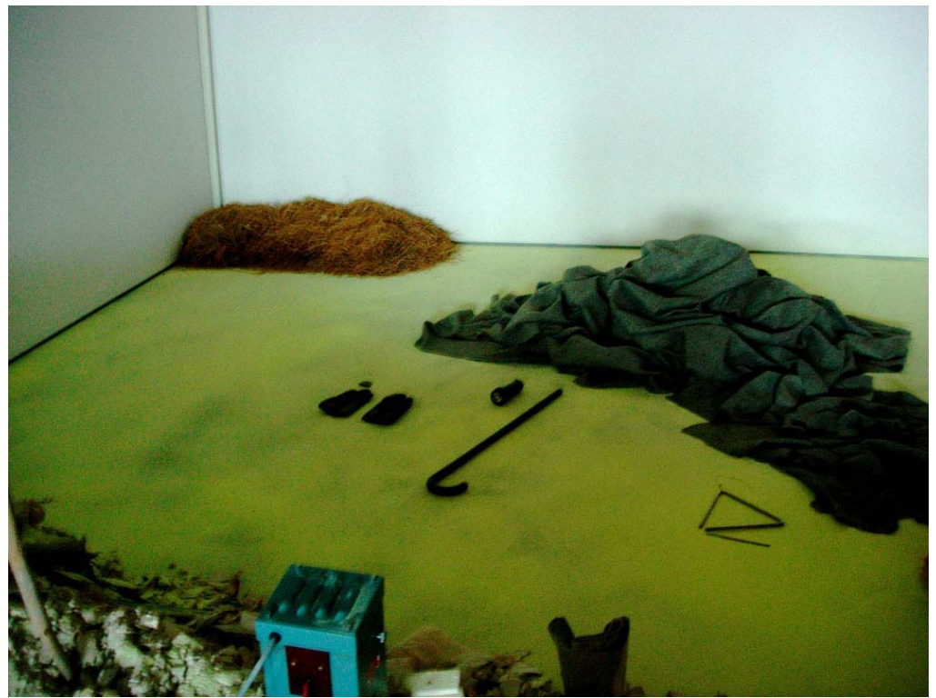
Figure 2 Aus Berlin: Neues vomKojoten, detail, 1979 Joseph Beuys