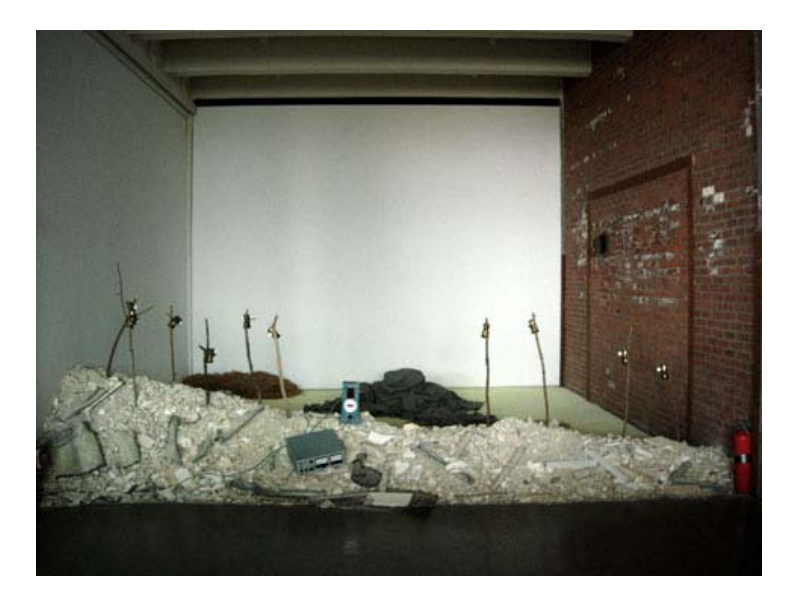
Figure 9 Aus Berlin: Neues vomKojoten, 1979 Joseph Beuys

damage potentially incurred. The rubble wall is at risk because each time it is shoveled in and out of containers for transport, its pieces are breaking down into smaller chunks. This could eventually substantially alter the look and feel of the barrier.