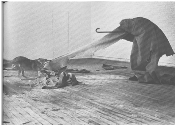
Figure 5 I Like America and America Likes Me, 1974 Joseph Beuvs René Block Gallery, Manhattan Photo published in Tisdall, Caroline. Joseph Beuys: Coyote. Münich: Schirmer/Mosel, 1976.

tones on the triangle attached at his waist. 13 After a 10-second pause, a recorded blast from a turbine engine would sound beyond the audience barrier at which point Beuys discarded his gloves and relaxed for a time before starting the sequence over again. The coyote participated in its own way too, marking each of the objects by pissing on them including fifty copies of the Wall Street Journal that were delivered to the gallery each dav. 14