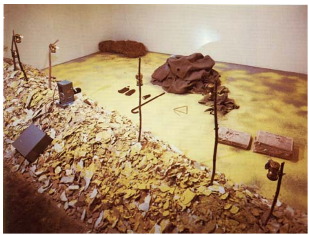
Figure 7 Aus Berlin: Neues vom Kojoten, 1979 Joseph Beuys

"Most people feel that they are at the mercy of the circumstances in which they find themselves. This leads, in turn, to the destruction of the inner self. These people can no longer see the meaning of life within the destructive processes to which they are subject, in the complex tangle of state and economic power, in the diverting, distracting maneuvers of a cheap entertainment industry." <sup>29</sup>