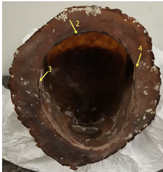
Figure 4: Sample sites. Left: Sample 1 from the top of exterior. Right: Samples 2, 3, 4: Excess material around interior ring.