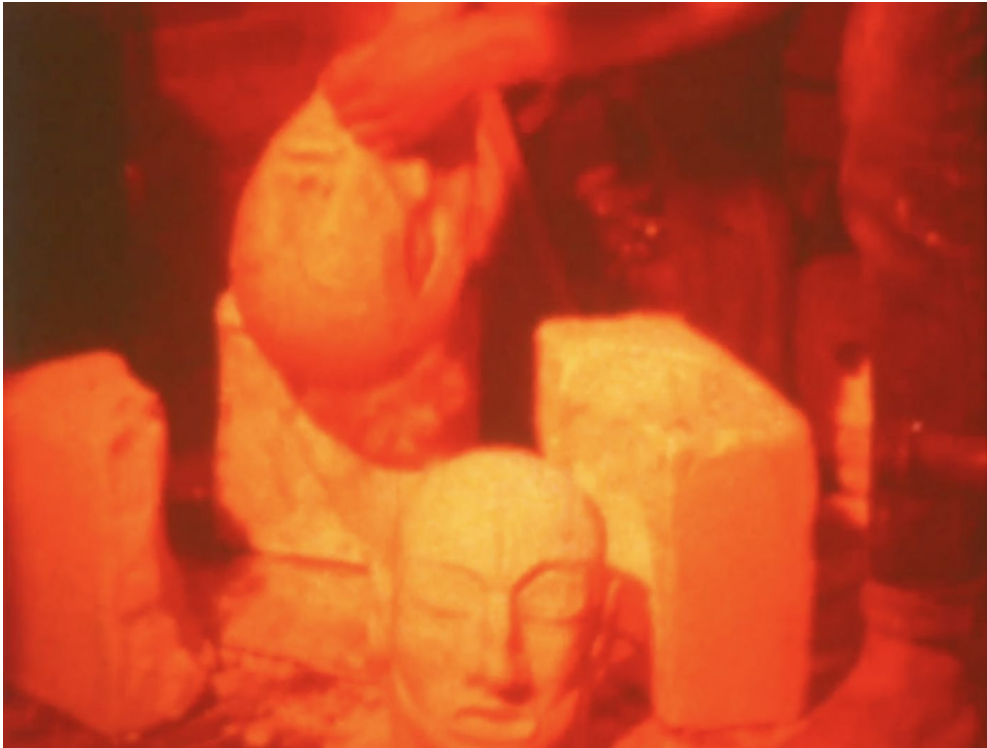
Figure 3. Richard Kern, still from “American Obsessions” 1983. Featuring David Wojnarowicz. Super 8 color on digital video, silent. 1:21 min.