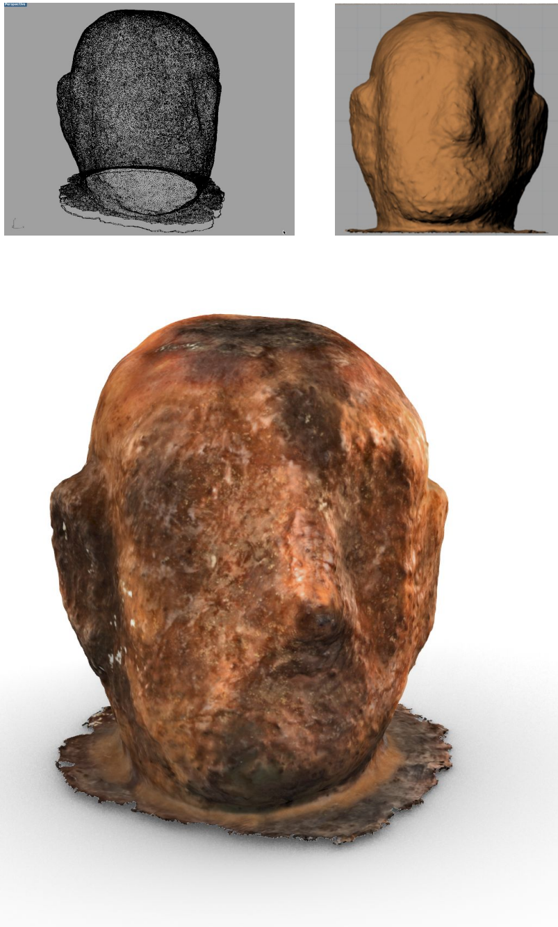
Figure 5. Point cloud (top left) geometry (top right), texture mapping applied to the geometry (bottom).