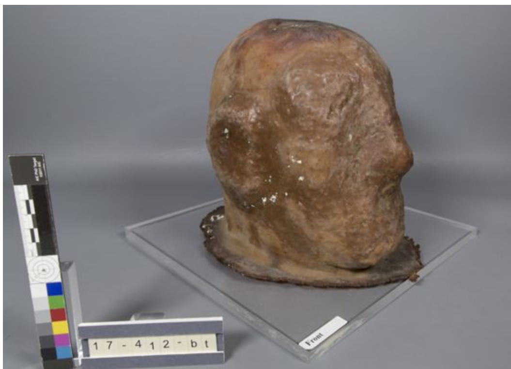
Figure 1. 2018 Digital photographic documentation (092.2.0360).