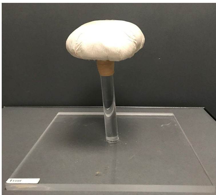
Figure 2. Internal support mount added in 2006. Materials include: Plexiglas base and stand, cast vulcanized silicone rubber, mylar, and Tyvek. 8