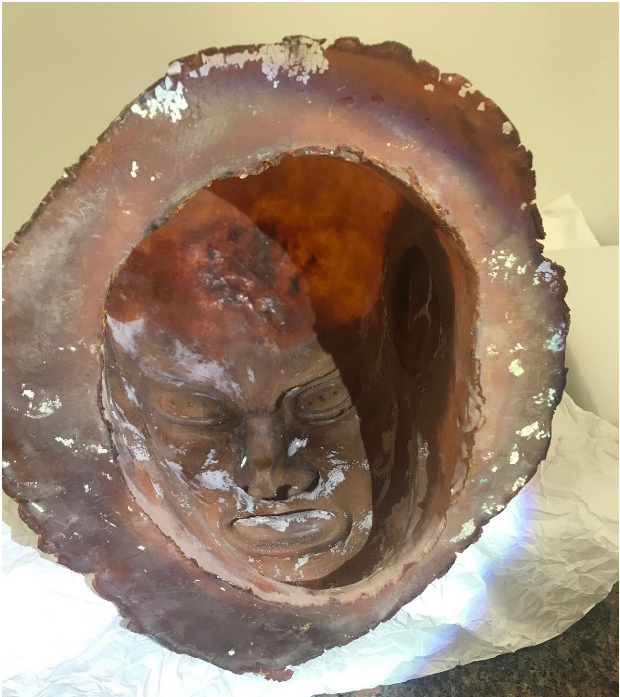
Figure 7. Details of the mold that create Metamorphosis .