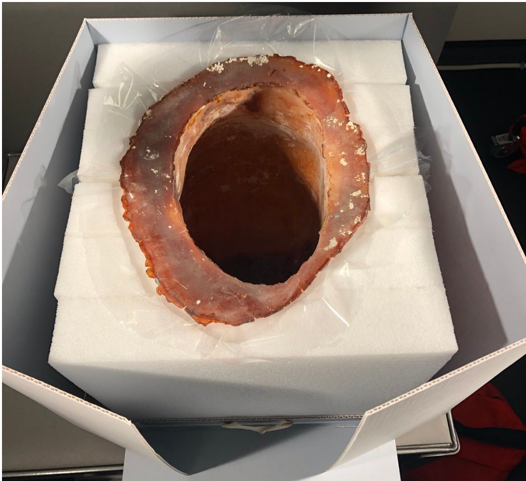
Figure 6. Object in its new custom CNC-routed housing.