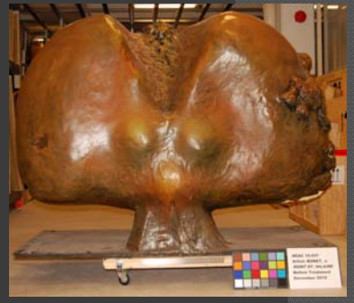
Fig 1. Mont St. Hilaire, Jordi Bonet, 1971

Mont St. Hilaire, a fiberglass-over-foam sculpture, was made by Jordi Bonet in 1971 for Queen's University. The sculpture remained outdoors on the Queen's campus for 22 years exposed to all weathers, until it was acquired by the Agnes Etherington Art Centre (AEAC) and relocated indoors due to its deteriorated state. The lower-right corner of the fiberglass coating had cracked and detached, exposing the inner foam core of the sculpture. A thorough analysis of the material composition of the paint and resin coatings, and foam core was completed using Fourier transform infrared (FTIR) spectroscopy, x-ray fluorescence (XRF), reflected light microscopy, and visual examination. Establishing the exact composition of the materials facilitated a recommendation for treatment and maintenance program for the sculpture.