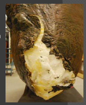
Fig 2. Detail of damaged area on sculpture