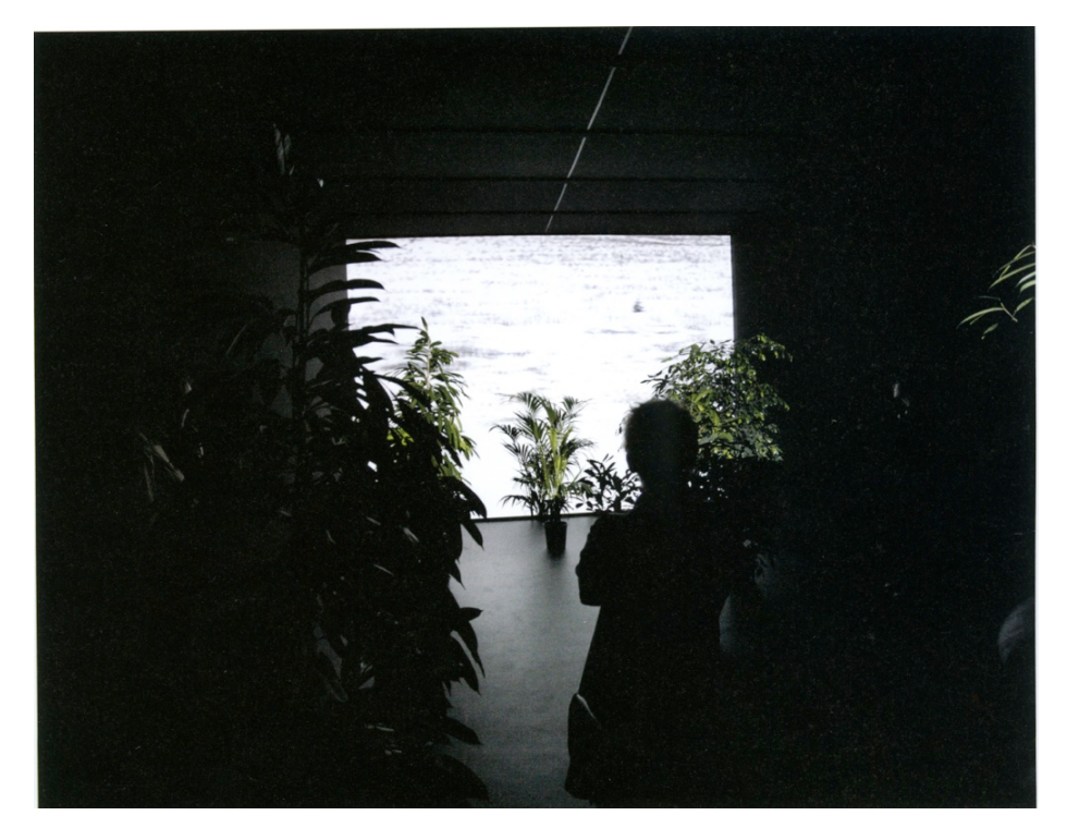
Sanja Ivekovic, Resnik, 1994. Overall. The Museum of Modern Art, New York.

Sanja Ivekovic's Resnik consists of a darkened room, ten to twenty ornamental plants meant to die over the course of the installation, and projected words and images.