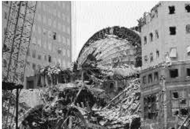
The Winter Garden on September 27.

were destroyed, given the number of law and investment firms in the complex.