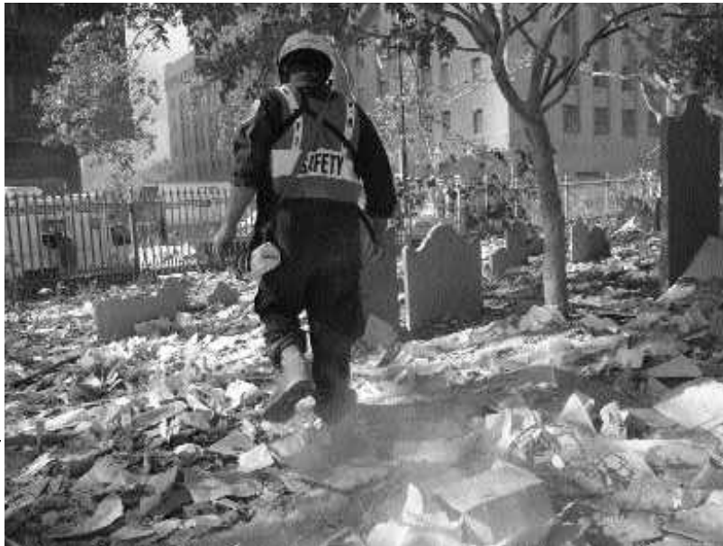
A firefighter walks among the historic headstones over in debris at Trinity Church Cemetery on September 19.

It took only minutes for the inferno to consume the archives and records of the Helen Keller International Foundation. An estimated $4 million in equipment, records, and historical data was lost, including first editions of Keller's works, priceless photographs, and many of her own letters.