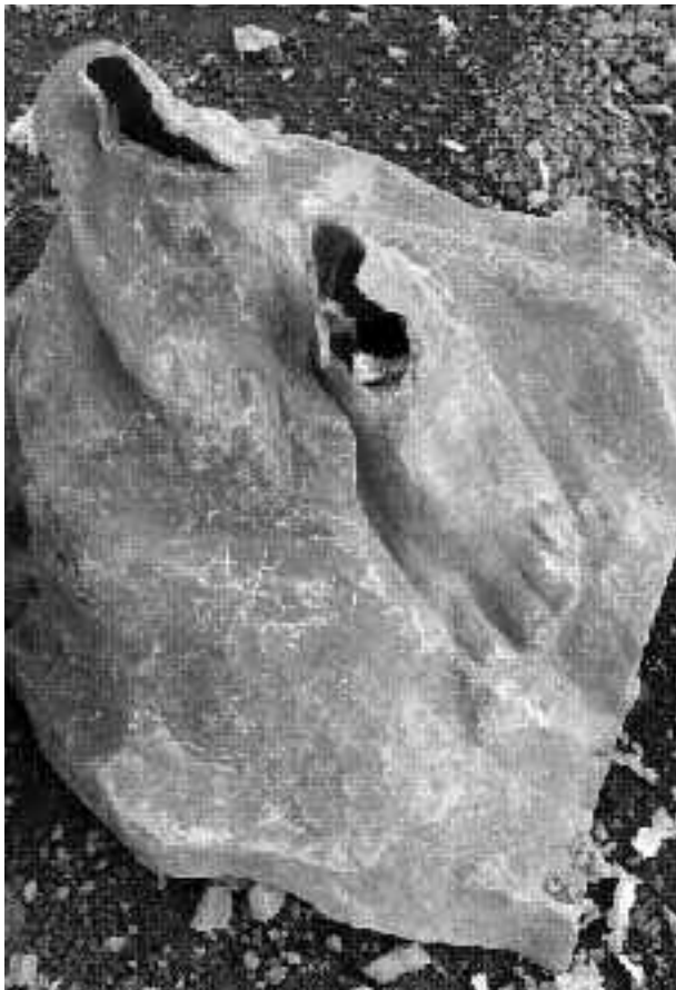
This piece of a Rodin sculpture bearing his signature was found at the World Trade Center site.