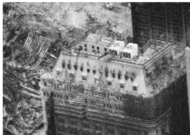
The top of 90 West Street, a 1907 building designed by Cass Gilbert, on September 27.

When the massive towers fell, fire and debris shattered the glass atrium of the beautiful Winter Garden and destroyed its eastern façade. As Tower Two collapsed, steel beams ripped numerous holes in the roof of the historic West Street Building and opened pathways for flaming debris. Fires burned on at least 14 floors with such intensity it took a day and a half to bring them under control.