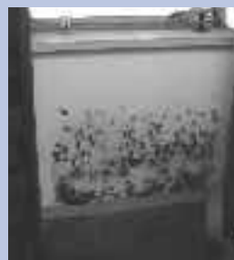
Left, mildew on walls. Right, some of the dangerous mold in a Navy office.