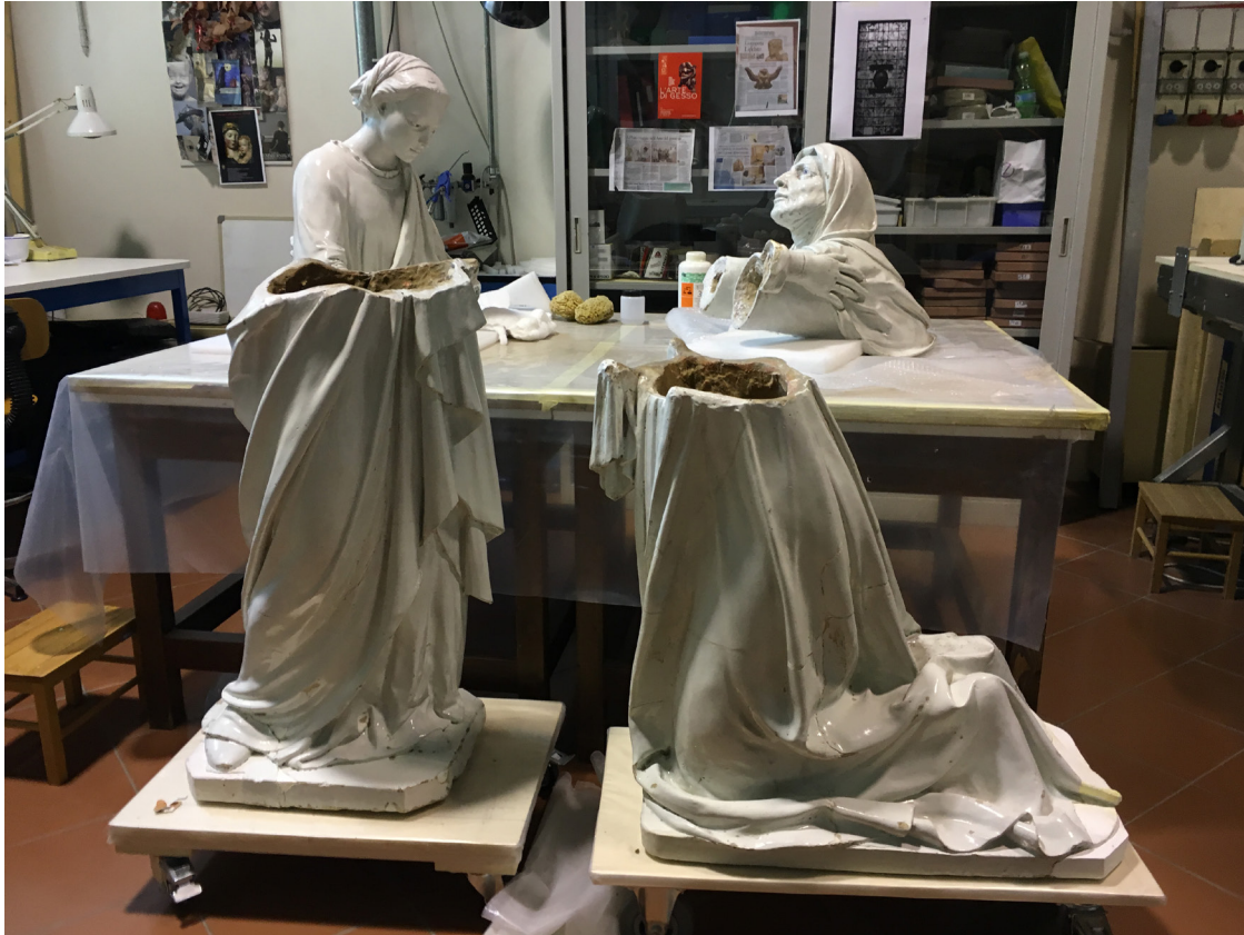
Fig. 5. Visitation after it arrived at the Laboratory of the Opificio

Inside the artwork there is, however, another purplish glaze. Analysis revealed that this glaze contains manganese and traces of an organic material. It is thought that during the second firing, other fissures opened. Thus, a manganese glaze—being much tougher, more resistant, and more hard-wearing than a tin glaze—was applied along with organic components used to further reinforce the enamel. Then, the sculpture was fired a third time, again inserting the same kind of terracotta wedges inside the fractures.