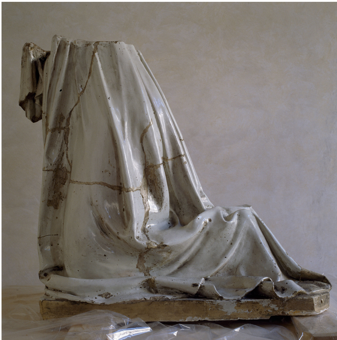
Fig. 9. Visitation : The lower section of Saint Elizabeth before the 1992 restoration