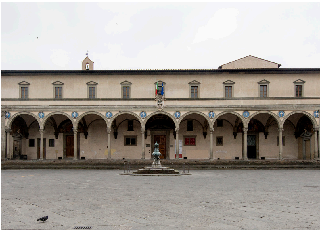
Fig. 2. Andrea della Robbia, Putti , 1487, Ospedale degli Innocenti, Piazza SS. Annunziata, Florence

this article will discuss how we tackled and solved both the aesthetic and technical aspects associated with the gaps in glazed terracotta works located outdoors. It will also touch on the concomitant issues related to exposure to atmospheric agents, stress caused by temperature changes, condensation, and pollution present in both air and rain water.