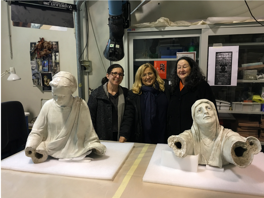
Fig. 10. Dismantled Visitation at the OPD Laboratory with the Boston colleagues

horizontally (fig. 11). Due to the presence of reinforcing gypsum, the cohesion between the parts is still effective except for a weakness along the upper edges of the two large pieces of the legs.