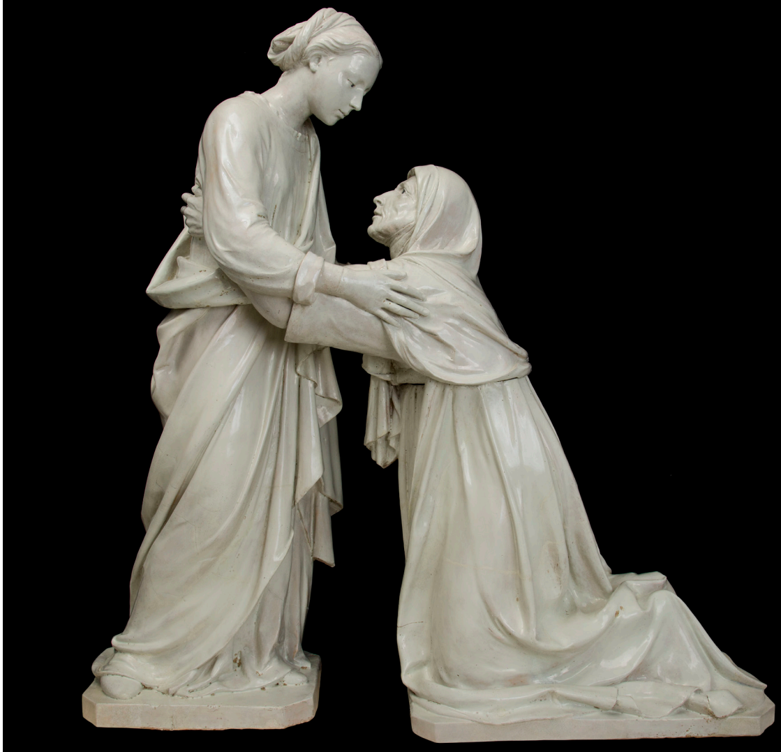
Fig. 3. Visitation after the restoration, front side

The group was fired in two sequential steps: the bisque firing, which transforms the clay into a ceramic body, and then a second firing, after the application of the glaze, at a temperature near 900°C (fig. 5).