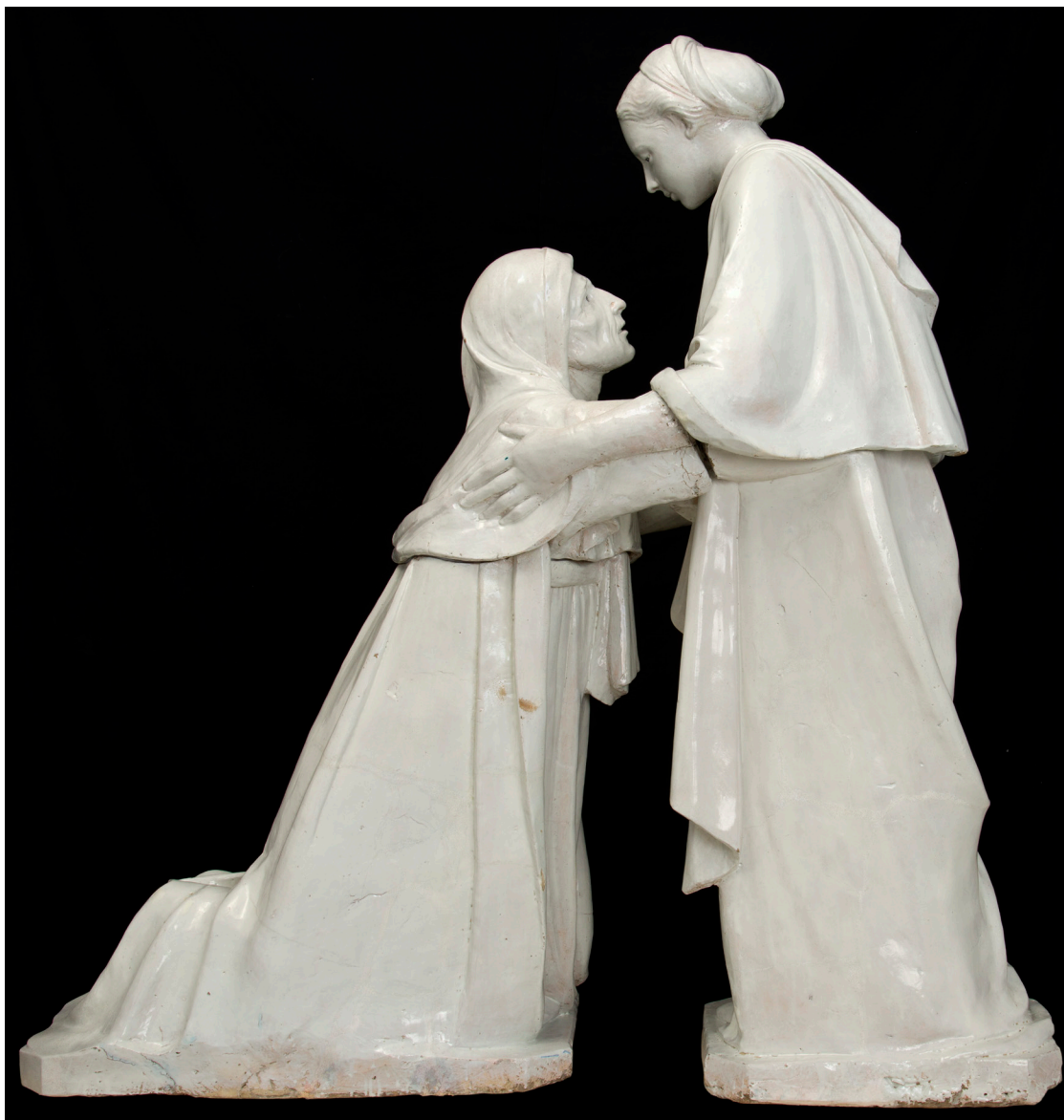
Fig. 4. Visitation after the restoration, back side

there were numerous microfractures and some major fractures, especially in the lower parts of the two figures, that went on to cause further breakages.