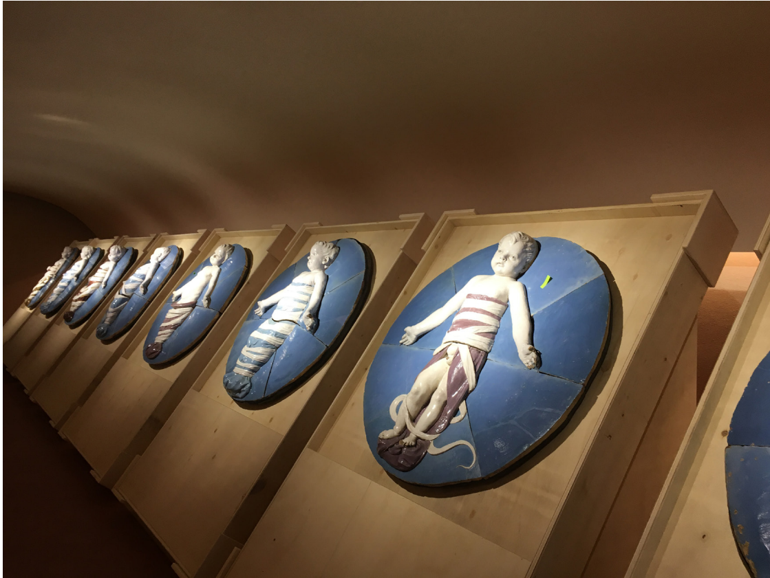
Fig. 17. Putti on exhibition at degli Innocenti Museum after the restoration

The restoration work was articulated in several phases. The most complex phase dealt with the creation of a carbon fiber support that was made under vacuum pressure with seven layers of carbon tissue and epoxy resin.