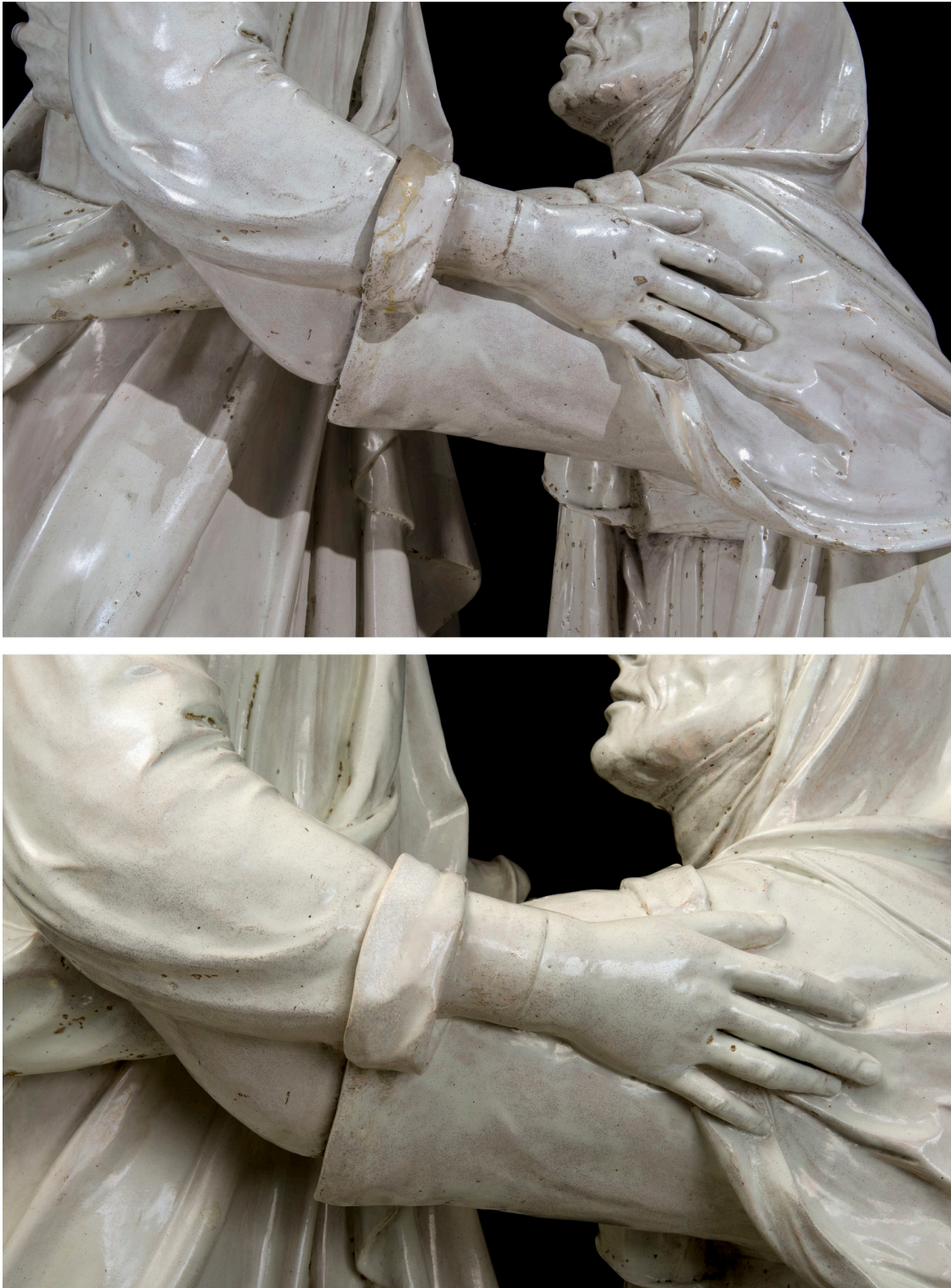
Fig. 13. Visitation : Detail of the arms, before and after the restoration