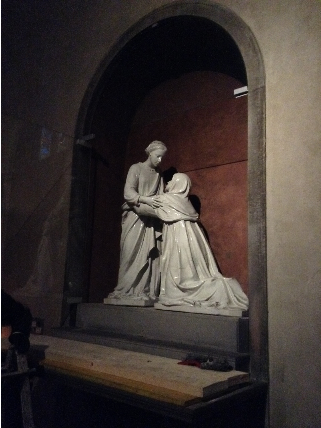
Fig. 1. Luca della Robbia, Visitation , 1445, glazed terracotta. Church of Saint Giovanni Fuorcivitas, Pistoia

Both works gave us the opportunity to experiment with and deepen our knowledge of new conservation solutions, especially the use of static stabilization systems, three-dimensional (3D) technology, and carbon fiber wall anchoring systems. The restoration has been divided into several different phases, but