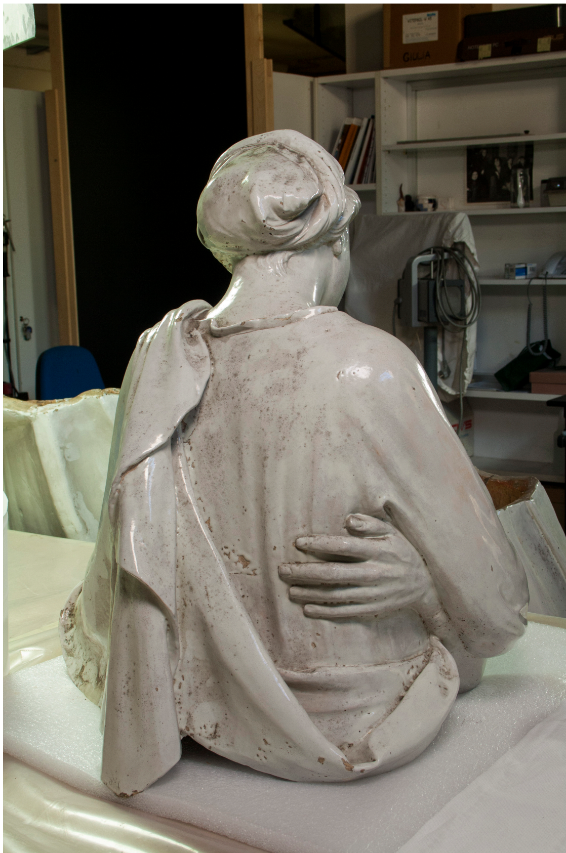
Fig. 6. Visitation : The upper section of Mary during the restoration