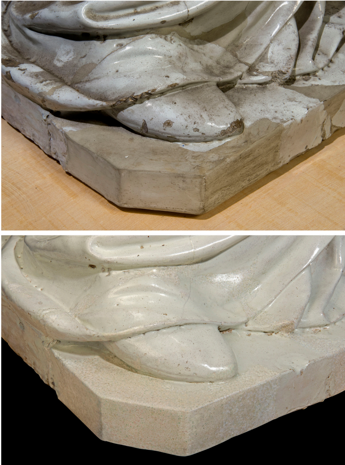
Fig. 12. Visitation : Mary's foot, before and after the restoration