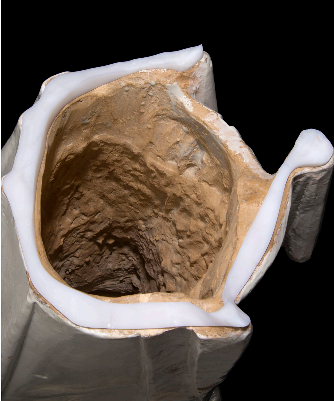
Fig. 16. Visitation : The 3D-printed cushion placed above the lower section of Saint Elizabeth

The resin gasket fills the gaps along the entire join so that there are no longer just a few contact points, but rather all the weight is continuously and evenly distributed. Its custom shape keeps the pieces in place and avoids unwanted movements or rotations of the busts. The resin's hardness is less than that of the terracotta; thus, if an accident should happen, this layer is sacrificial, saving the sculpture's border without stressing the glazed surface.