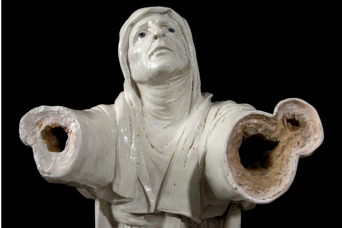
Fig. 7. Visitation : Detail of the bust of Saint Elizabeth

In preparation for celebratory events related to Pistoia being named capital of culture in 2017, a new restoration of the artwork was begun, assisted in large part by funding received from the Museum of Fine Arts, Boston (fig. 10). In this new intervention, the Opificio revisited the restoration of 1992, which had altered considerably, and realized new procedures aiming to improve the artwork's stability and its aesthetic appearance. Our intervention foresaw new fills that are less visible and certainly more long-lasting thanks to the use of watercolors instead of gouache and a 3D consolidation system.