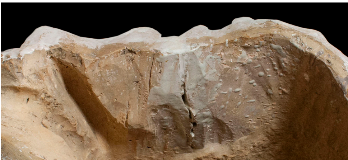
Fig. 8. Visitation : Small terracotta wedges inserted inside the firing fractures

In preparation for celebratory events related to Pistoia being named capital of culture in 2017, a new restoration of the artwork was begun, assisted in large part by funding received from the Museum of Fine Arts, Boston (fig. 10). In this new intervention, the Opificio revisited the restoration of 1992, which had altered considerably, and realized new procedures aiming to improve the artwork's stability and its aesthetic appearance. Our intervention foresaw new fills that are less visible and certainly more long-lasting thanks to the use of watercolors instead of gouache and a 3D consolidation system.