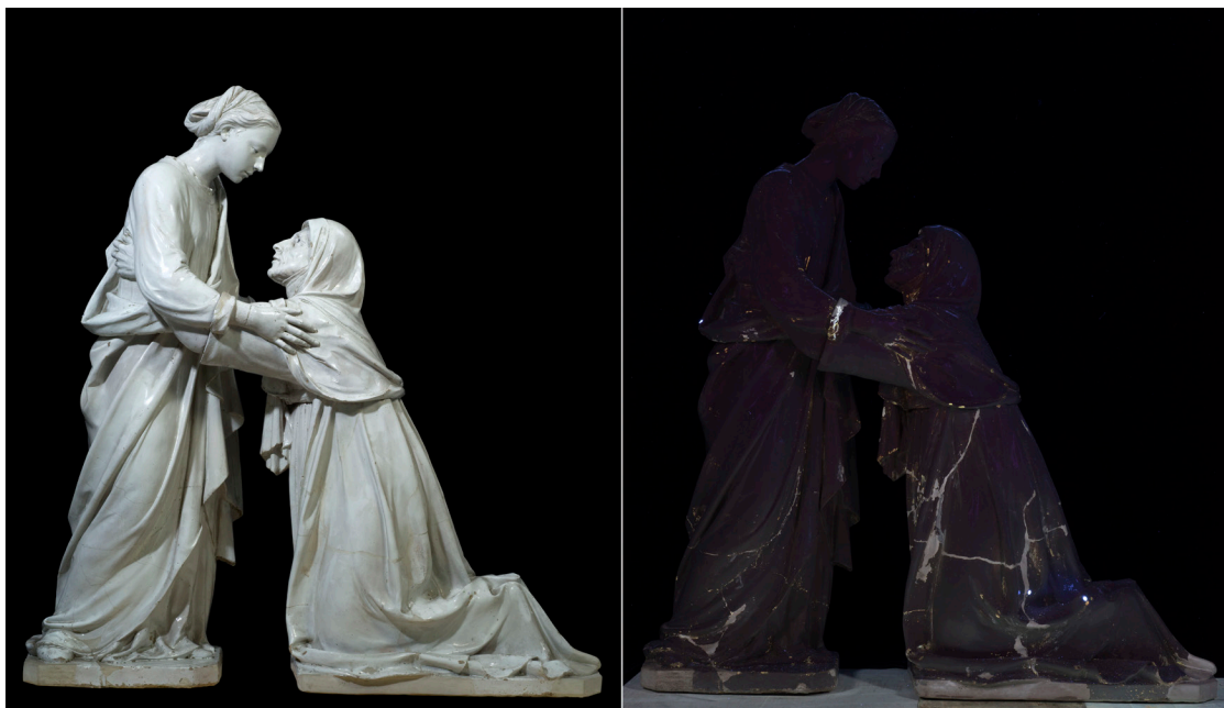
Fig. 11. Visitation : Comparison under visible light and UV radiation

with a white acrylic filler, which guarantees a safe and easy reversibility and resists humidity, and then smoothed with sandpaper, taking great care not to touch the surrounding glazed areas (figs. 12, 13). The firing defects were not filled, as is the normal practice of the methodology adopted at the Opificio (see figs. 3, 4).