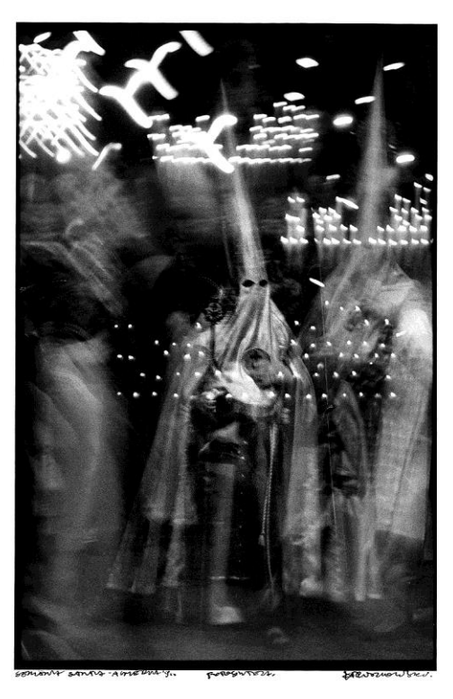
Fig. 8. Krzysztof Pruszkowski. Easter, Almería. Imagina project Collection. Fiber-base Silver Gelatin DOP print, 1991. Andalusian Center for Photography.

Thanks to Fernandez Rivero Private Collection, one of the widest and most consciously assembled collections of nineteenth century Spanish photographs, for the use of their images.