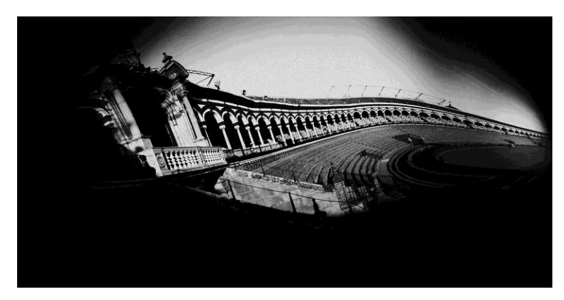
Fig. 6. Ilan Wolff. Bullring of La Maestranza Sevilla. Andalusia Project Collection. Pinhole Camera. Fiber-base Silver Gelatin DOP print, 2010. Andalusian Center for Photography.

This aspect of the project will begin with three training programs for description, preservation, and diffusions of photograph collections. If the initial programs are effective, they are going to be introduced through all of Spain's autonomous regions.