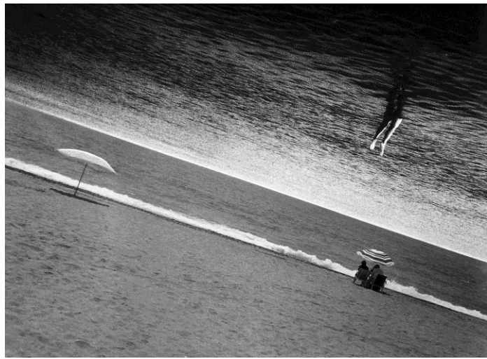
Fig. 4. Jorge Rueda. Miramar 5. Imagina Project Collection. Silver Dye Bleach print, 1991. Andalusian Center for Photography.

To meet these aims, under these circumstances, it was necessary to keep these three key points in mind: sustainability for systematization, improvement for training, and communication for cooperation.