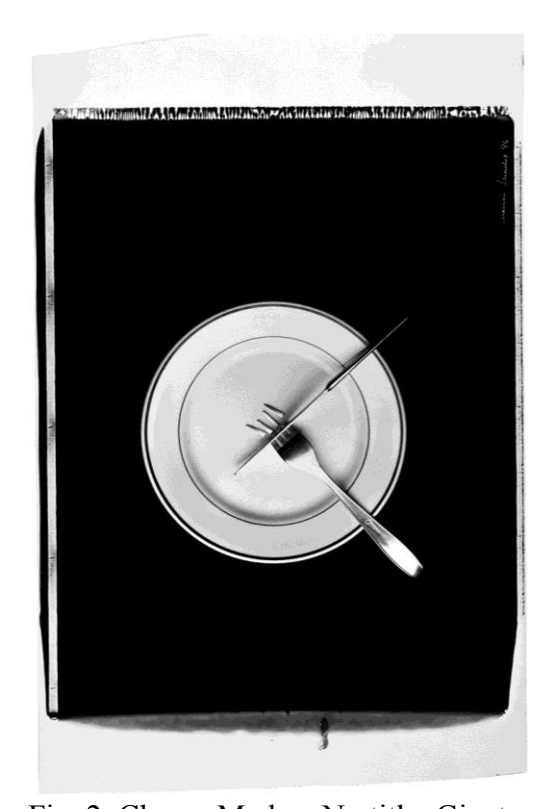
Fig. 2. Chema Madoz. No title. Giant Polaroid Project Collection, 1994. 20x24 Polaroid Dye Diffusion Transfer print. Andalusian Center for Photography.

In early 2014 the General Administration of Fine Arts and Cultural Assets called representatives from autonomous communities, central government, and experts in the field to a first meeting. Many questions came up. Where to start, what kind of raw materials is available? What is it possible and practical to include within the plan? How is it going to be done?