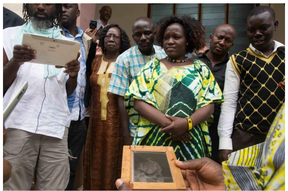
Fig. 3. Demonstration of the printing-out process at the École du Patrimoine Africain , Porto Novo, Benin.

The workshop sparked probing questions and compelling contributions from all participants. Some of the most significant brainstorming sessions focused on the use of clay and earthen architecture to provide passive cooling, other traditional building techniques to promote ventilation and air circulation, and the option of solar-powered refrigeration technologies.