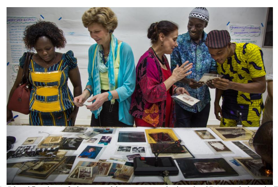
Fig. 1. Identification of photographic processes during the 3PA workshop in Benin.

In response to these challenges, the École du Patrimoine Africain (EPA, http://epa-prema.net/) partnered with the Department of Art Conservation at the University of Delaware (UDel), the Centre de Recherche sur la Conservation des Collections in Paris (CRCC), the Photograph Conservation Department at The Metropolitan Museum of Art (The Met), and Resolution Photo (https://www.resolutionphoto.org/) to identify important photographic repositories at risk and to develop, organize, and administer a four-day photograph preservation workshop held April 22-25, 2014. Key to these efforts were Resolution Photo's extensive knowledge of and contacts in the region which established relations with the host institution and introduced networks through which to promote the event.