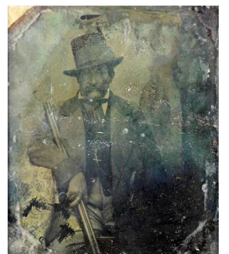
Fig. 2. Janez Puhar, Portrait of a Man (Portrait of Brother in Law) , puharotype, 115 x 92 mm, ca. 1855.