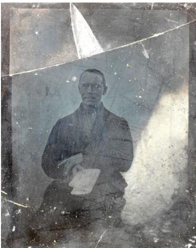
Fig. 1. Janez Puhar, Self portrait , 120 x 100 mm, puharotype.

Puhar is mentioned in only a few histories of photography. He is described in Wilhelm Mutschlechner's exhibition catalogue (1984, 10) as an "independent inventor of photography on glass". Wolfgang Baier (1965, 152–153) summarized the Vienna report about his process. Together with a short description of his process, and with some doubts, he was included among the pioneers of photography in Helmut Gernsheim's History of Photography (1955, 45–46).