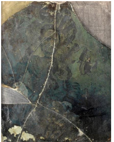
Fig. 3. Janez Puhar, Portrait of a Woman (possibly Sister), puharotype, 115 x 92 mm.