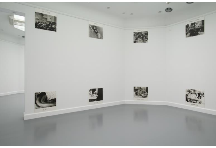
Fig. 1. John Baldessari, Virtues and Vices (for Giotto) , 1981, unframed. Collection of the Van Abbemuseum, Eindhoven. Image: Peter Cox, Eindhoven.

Each photograph of the series is 76 x 76 cm and is glued at the back onto a sheet of foam board of the same dimension. Each photograph is divided into two sections: a black-and-white photograph and a white area. In the white area, above or underneath the photographic image, black capital letters have been applied onto the surface by transfer letter using the dry technique. The resulting word on each photograph represents either a virtue or a vice. The title refers to a work by the Italian painter Giotto in the Arena chapel at Padua, and it is an artistic homage to this artist Baldessari whom so greatly admires.