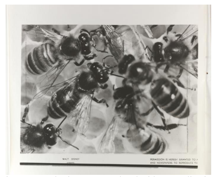
Fig. 2. Second print uncropped and without application of the dry transfer letters.

In 1984 and 1989, damages on the surfaces were reported in the Van Abbemuseum's internal records. Both incidents occurred during installation when the artwork was on loan to other museums. On both occasions, the curators of the museum asked Baldessari about the possibility of reprinting photographs. In 1992, the artist agreed to reprint a new series. Because of financial constraints, it was established that a new set of photographs would be printed in Los Angeles, home base of the artist, directly from the negatives and without comparison to the first