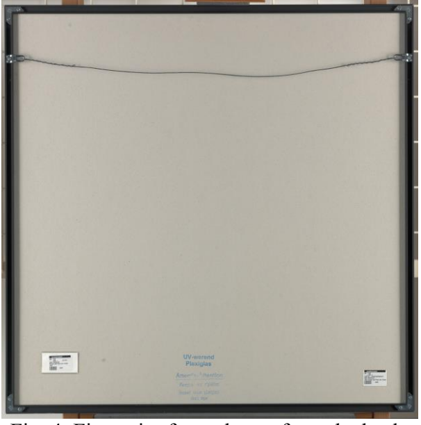
Fig. 4. First print framed seen from the back.