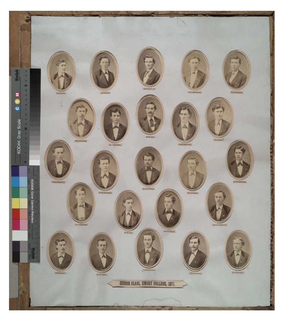
Figure 1. Matted cabinet photographs