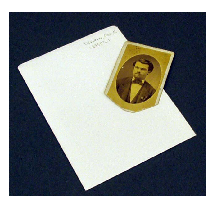
Figure 5. Rehoused cabinet photograph