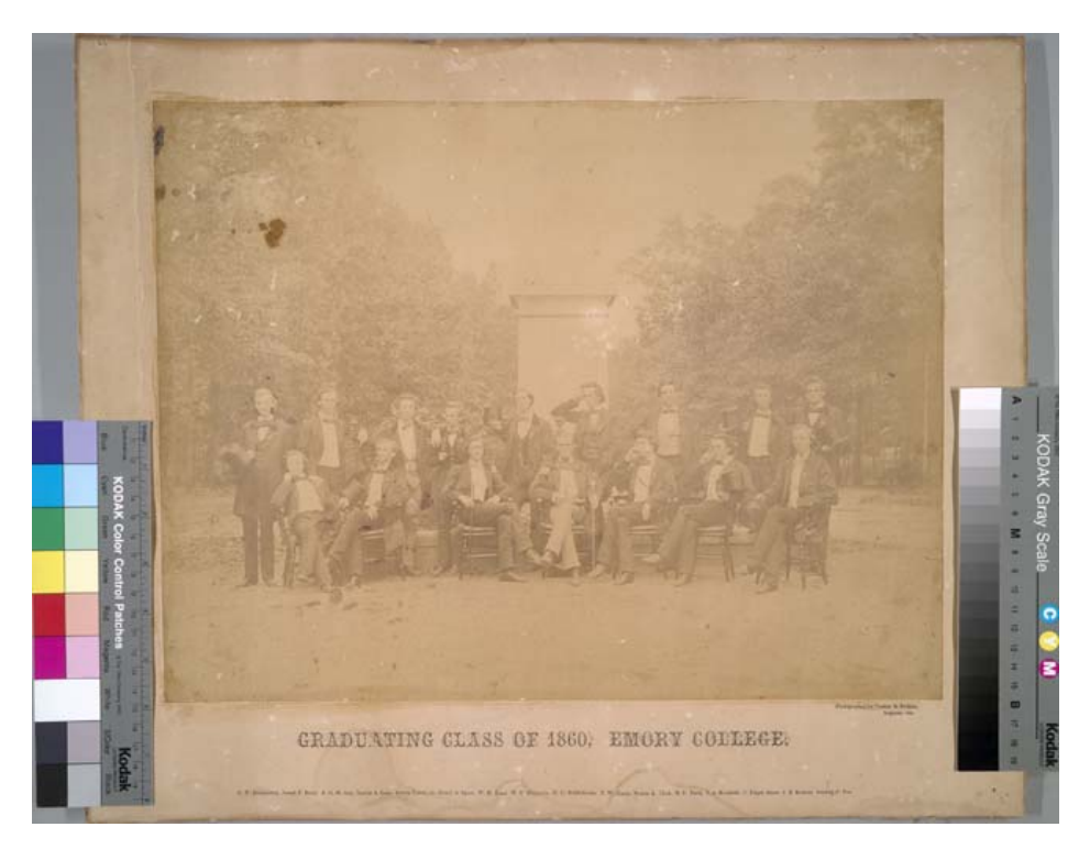
Figure 3. Group portrait