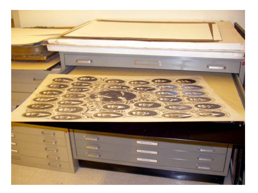
Figure 6. Storage for collages