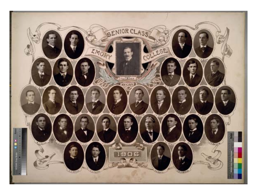
Figure 2. Collage