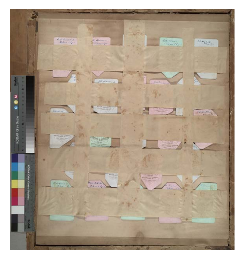
Figure 4. Verso view of cabinet photographs mounted onto multiple window mat

Previous damage from unsuitable framing and storage was evident. All of the multiple window mats were acidic, very dirty, and heavily damaged. Many of these mats were not from original framing. For example, some of mats had the students' names cut out and pasted onto the matting; a few others were missing images or had duplicates inserted. The cabinet photographs were attached to the back of the multiple window mat boards by a variety of methods. Several types of tapes and adhesives were used including paper, linen, masking, strapping, and black plastic electrical tapes as well as hide glue, some of which was tinted orange. Other adhesive supports included library bookplates, newsprint clippings, and bright pink craft paper (see figure 4).