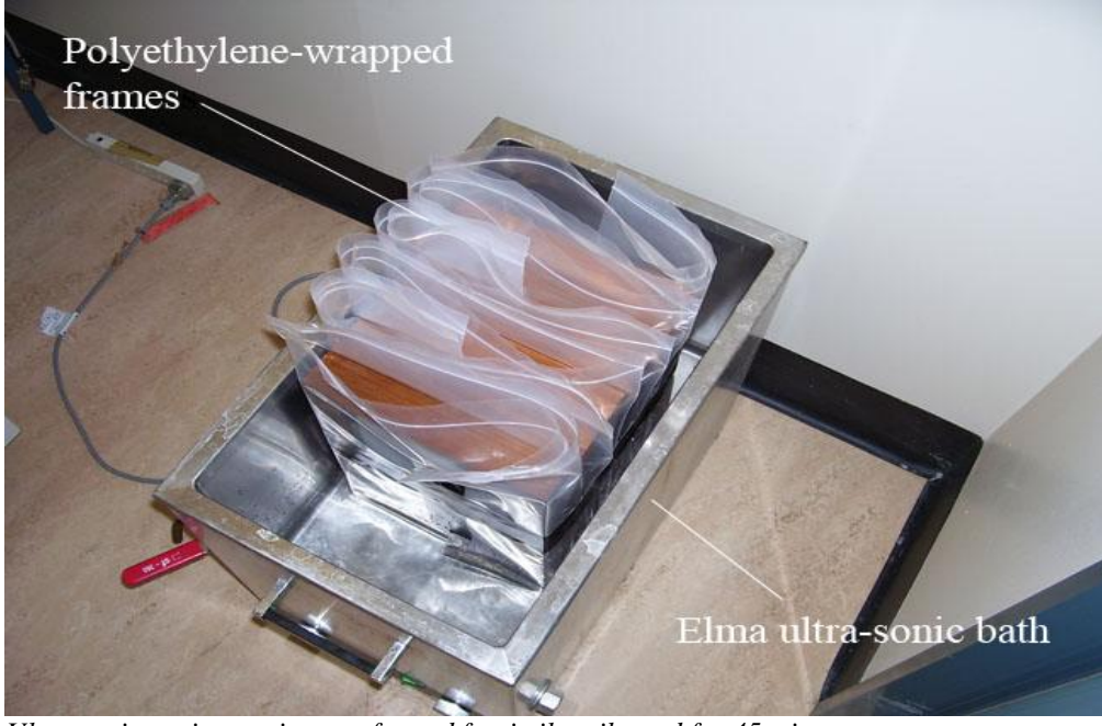
Ultra-sonic equipment in use - framed facsimiles vibrated for 45 minutes at approximately 40kHz, protected by heavy-duty polyethylene bags

A Transsonic 1040/H Ultra-Sonic bath, manufactured by the German company Elma®, was used to simulate vibration. The constant operational frequency of the apparatus is 40kHz, provided by spread-beam transducers mounted under the base plate of the bath. Typically, the bath is filled with water and a small metal base plate distributes ultrasonic vibration. In a trial run it was established that an insufficient level of vibration was being transferred to the samples and the tri-wall cardboard housing used to hold the frames during testing also dampened the vibration. As an alternative the frames were placed in direct contact with the base plate and partly submerged below water level. To avoid water damage, each sample was placed in a heavy-duty polyethylene bag. The bags remained unsealed to avoid the development of a microclimate. The actual vibration of each sample batch was approximately forty-five minutes at a frequency fractionally below 40kHz. On completion the samples were removed from the polyethylene packaging and returned to the control environment.