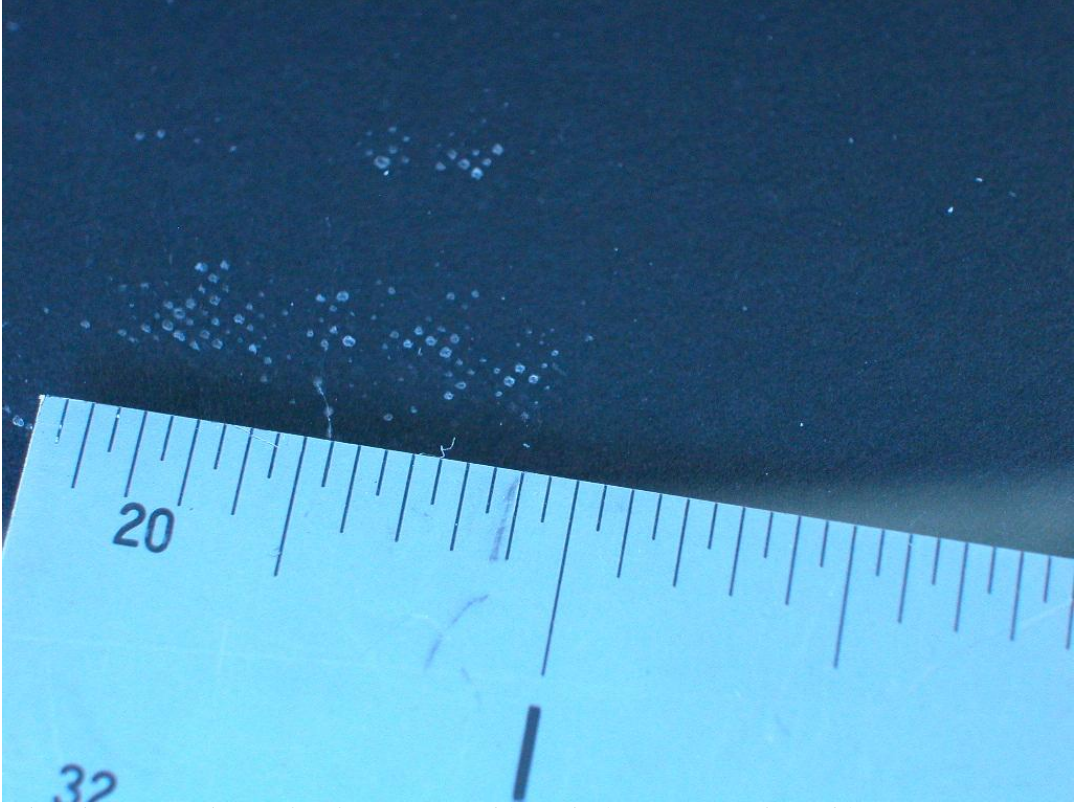
White deposits on the acrylic glazing removed from the frame previously used for an Andy Warhol screen-print - the pattern of dots corresponds exactly to the image

One instance which stands out involves most of the works of art in one particular NGA travelling exhibition. Of the ninety works, seven had been directly affected with white deposits forming on the surface of the works, while the remainder had instances of the deposit developing on the window mounts. This exhibition had been travelling for about a year, but it appears that the deposit can form in a relatively short period of time as it has been recorded as recurring on cleaned works within the space of three months.