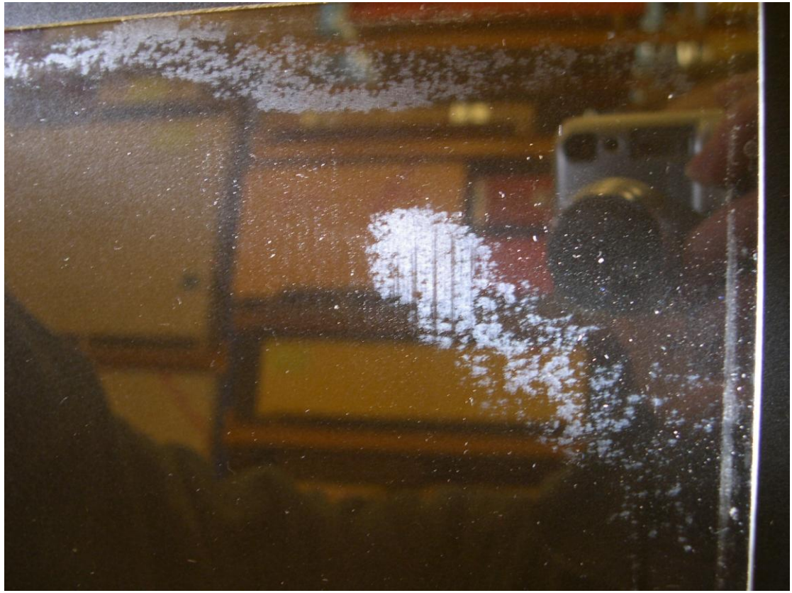
Detail of black and white silver gelatine photograph by Yousuf Karsh, with white deposits on the surface of the photograph and on the interior surface of the acrylic glazing

Some framed photographs and works of art on paper in NGA travelling exhibitions glazed with acrylic had developed areas of a white deposit on their surface during the scheduled tour. When first discovered on a group of large silver gelatine black and white photographs by Yousuf Karsh, it was thought that the works had suffered some sort of mould growth. Prior to exhibition at the next venue, these works were unframed and both the surface of the emulsion layer and glazing were cleaned. At the final exhibition pack up, three months later, the white deposit was found to have reformed in the same areas on these works.