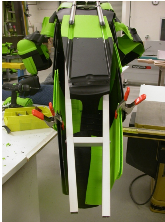
Fig. 2. An internal support structure was added to the crocodile