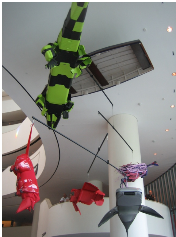
Fig. 1. Crux (as seen from those who sleep on the surface of the earth under the night sky). Collection of the National Museum of the American Indian. 26/7253.

conservation, refurbishment, and installations were truly collaborative projects and included not only NMAI and MCI conservators and fellows, but conservation scientists from MCI and the National Gallery of Art, as well as NMAI exhibit design, collections, registrar, and curatorial staff and contracted engineers, and perhaps most importantly, the artist himself.