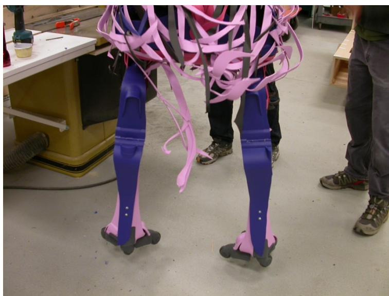
Fig. 3. Refurbishment of the emu

Modifications were also made to the legs of the emu. The legs were attached at the top to the suitcase wheels with only one point of connection, which was causing disfigurement and whitening of the plastic material. On each attachment, a small piece of rectangular aluminum flat sock was attached at two points to the leg, and one point to the wheel. The metal was covered with pieces of luggage of the same color to hide the aluminum plate. Additional pieces of new blue F'lite luggage were added to the legs and attached to the lower leg with bolts. Mr. Jungen expressed dissatisfaction with the emu's head. The head was removed, and a new head, which had been previously made at the Sydney Biennale, was attached and a piece of luggage was added to the neck to make it more substantial. A large piece of blue F'lite luggage was also attached to the front breast of the emu.