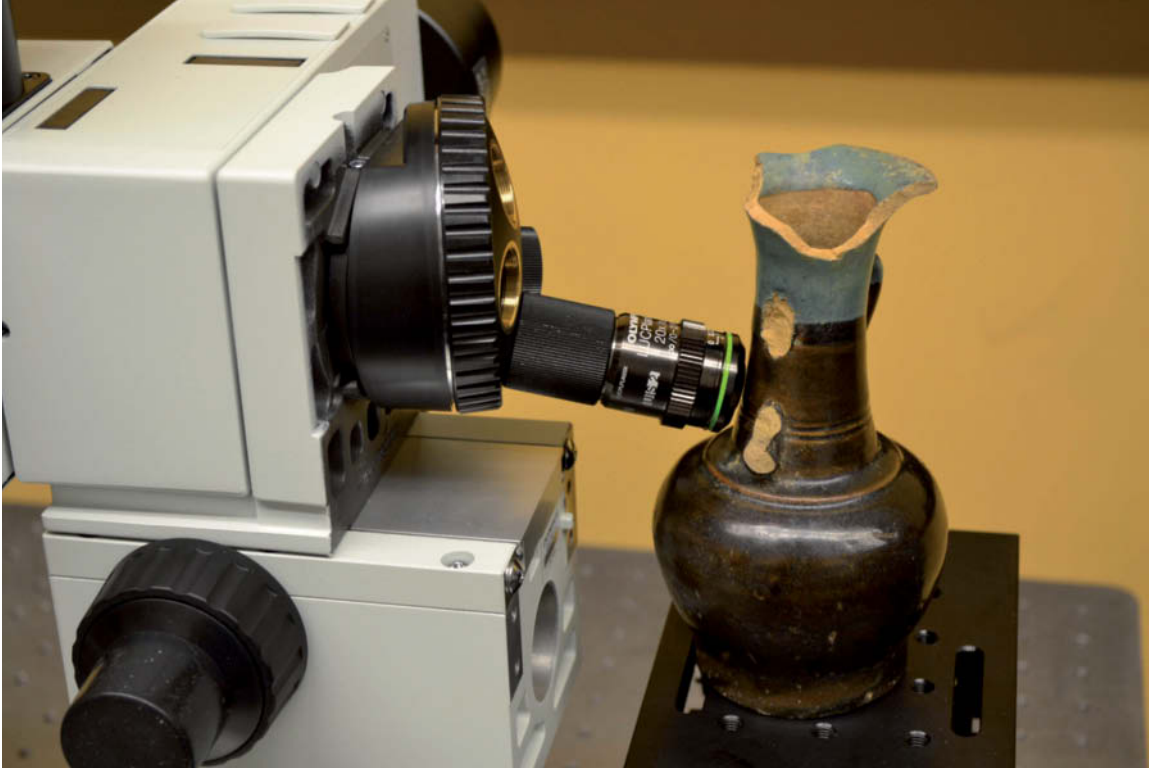
Fig. 5. Ceramic artifact from Ishigaki Island being analyzed using a Raman spectrometer with horizontal exit. Artifact courtesy of Paul Lorimer