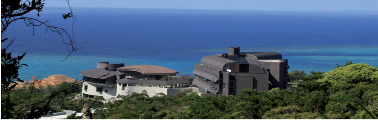
Fig. 1. View of OIST Campus, Onna Village, Okinawa, Japan

the Ryukyu Kingdom. It was an independent kingdom largely dependent upon trade, although still heavily influenced at times by Japan and China (Kamakura 1978). The international links of the Ryukyu Kingdom have influenced Okinawan art and culture, and today it is still common to find foreign artifacts in archaeological excavations as exemplified in local museum collections.