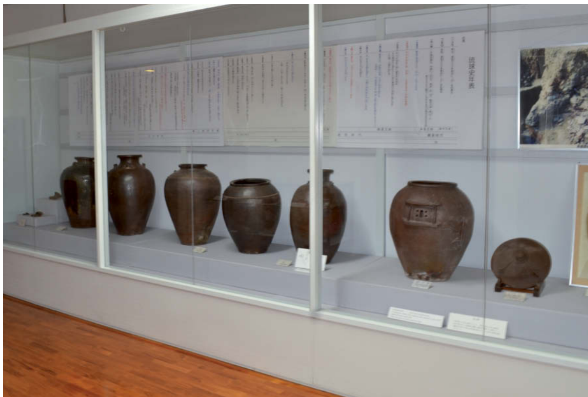
Fig. 2. Large 15th–17th century ceramic jars from Kina Kiln on display at the Yomitan Museum

The Yomitan Museum of History and Folklore is a small history museum located in Yomitan Village near Okinawa Island's central west coast. The Yomitan Museum was first to agree to collaborate with OIST. Their collection focuses on the Yomitan area, which has a history as a port village. The museum is built next to the Zakimi Castle World Heritage Site, and its collection contains many archaeological finds from this site. Additionally, due to the museum's close proximity to the ruins of the old Kina pottery kiln, its collection also boasts many ceramic vessels made at Kina. These include large pots as seen in figure 2, which include both food storage containers and burial urns.