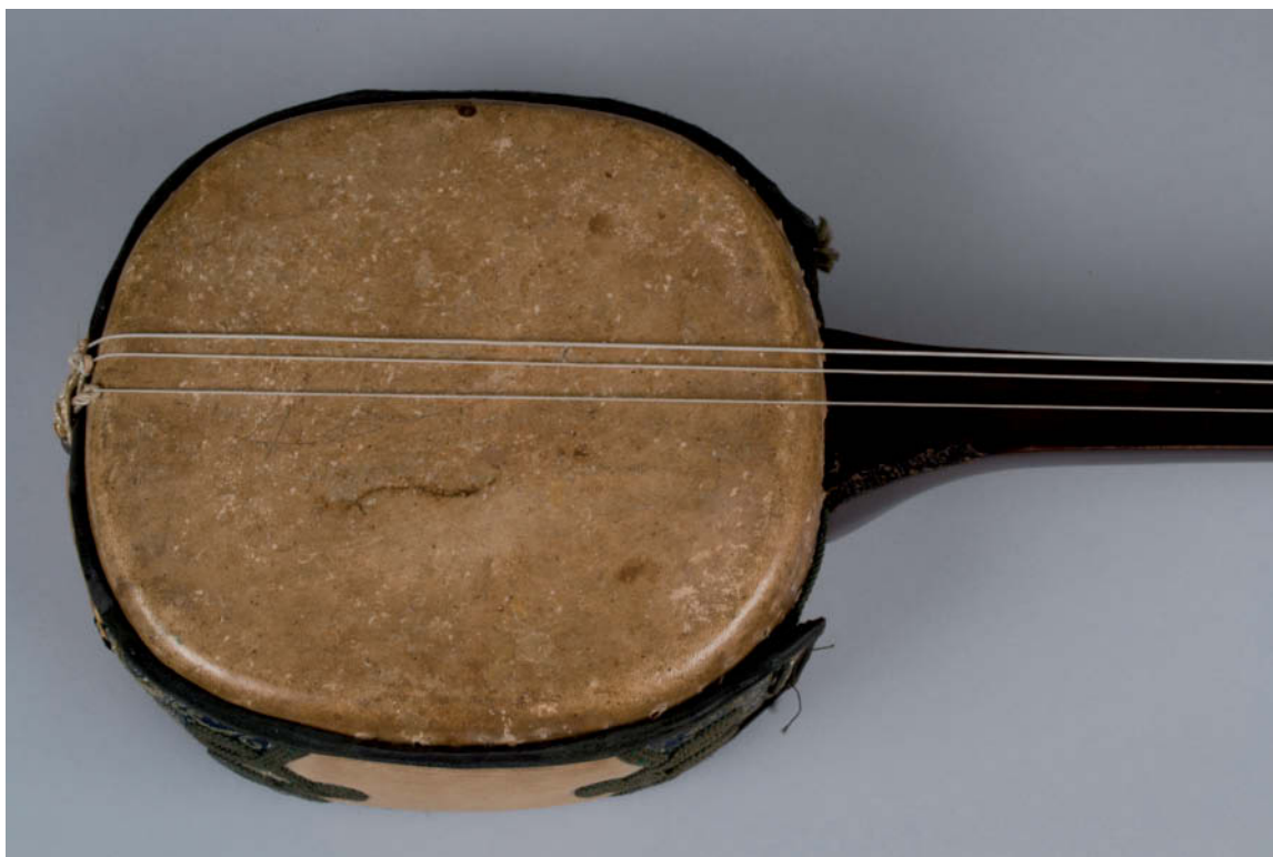
Fig. 9. Sanshin A after loss compensation of insect damage using toned Japanese paper fills