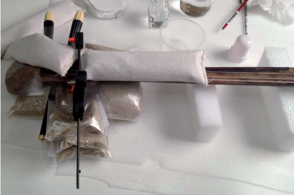
Fig. 13. Sanshin B , during treatment, clamping and weighting lacquer during post-consolidation drying