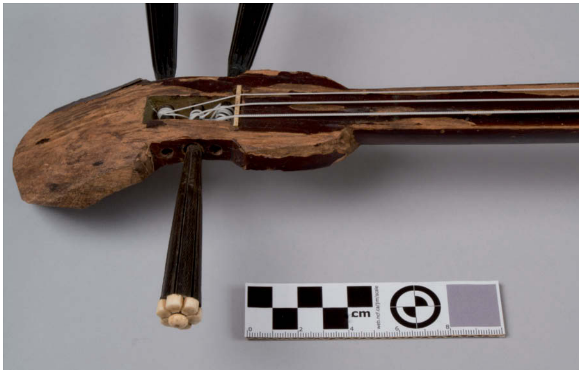
Fig. 11. Sanshin B before treatment, showing flaking and lost urushi lacquer