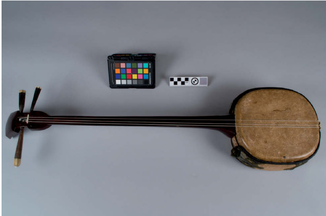
Fig. 10. Sanshin A after treatment

damage with Japanese paper allowed them to be aesthetically integrated with the rest of the leather cover. Repairs to the textile were also made using toned Japanese paper and methylcellulose. The lacquered neck was cleaned overall using mineral spirits. More unsightly areas were cleaned further using a 1% (w/v) phytic acid chelating solution in distilled water with Triton X-100 and methylcellulose as a thickener, as outlined by Schmuecker (2011, 181). The few small lacquer losses were filled with Flügger acrylic putty burnished to increase gloss, then inpainted with powdered pigments mixed with B-67 in xylene. Lastly, the strings were retied in place and the broken tuners were repaired using fish glue bulked with cellulose powder. After treatment, proper archival housing was created for Sanshin A before returning the artifact to the Yomitan Museum. The object is now in stable condition and able to be exhibited (fig. 10).