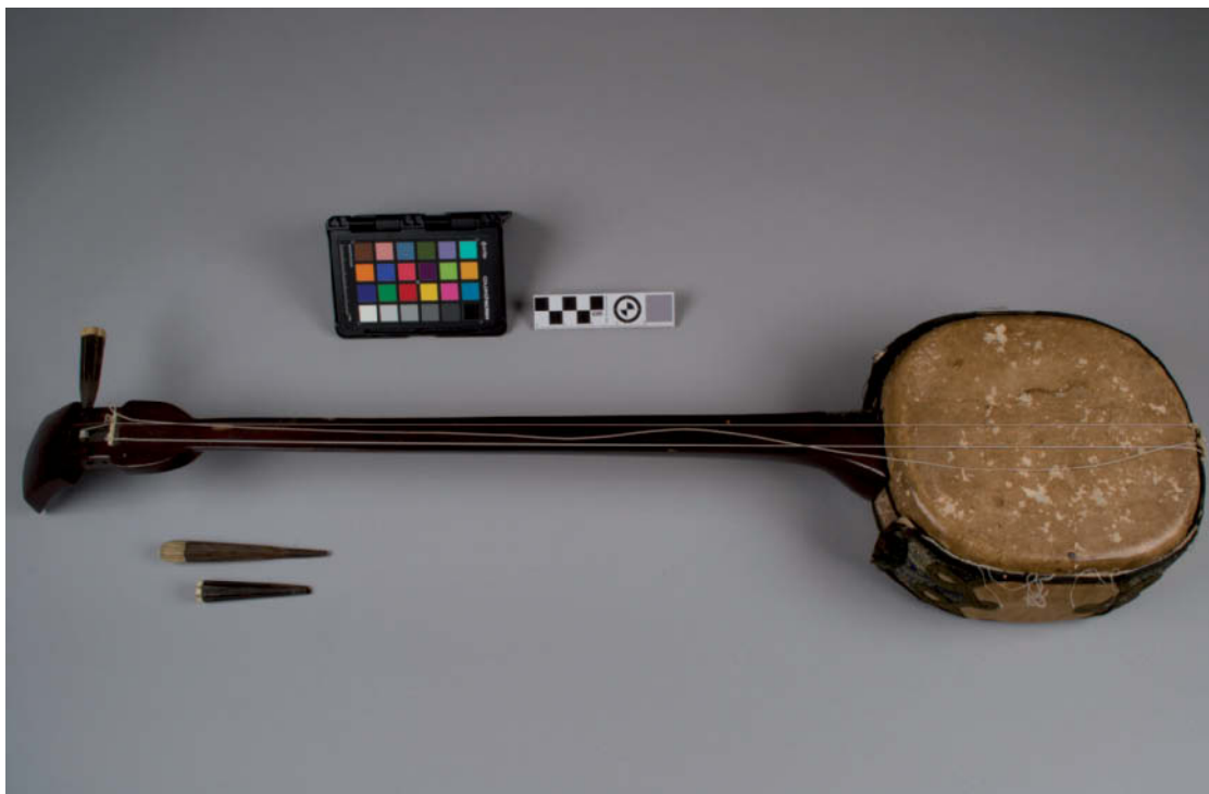
Fig. 6. Sanshin A , before treatment. Artist Unknown, Okinawan Sanshin, early 20th century, wood, leather, lacquer, textile, bone, 77 × 19 × 8.3 cm, Yomitan Museum of History and Folklore, 4482