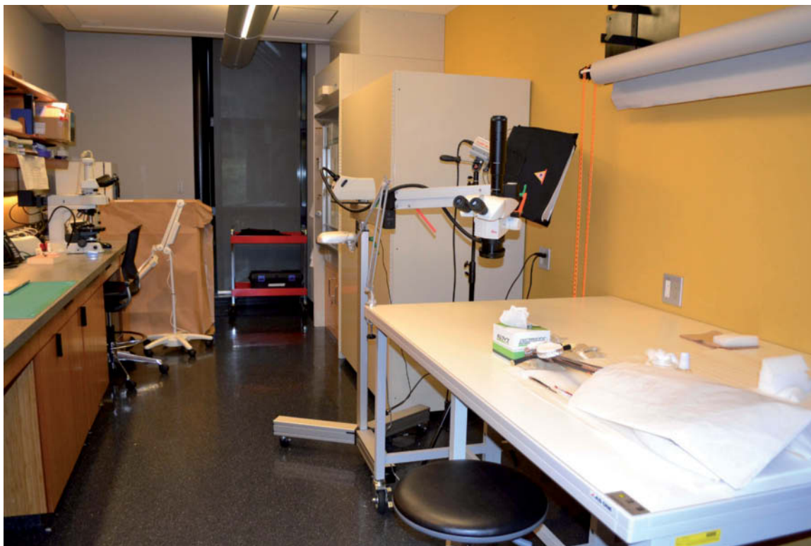
Fig. 4. Art Conservation Lab at OIST

I also participated in the design and purchasing of analytical equipment for OIST's physics common resources department in order to optimize their ability to be applied to the study of art objects. The most involved equipment discussions surrounded the purchase of a Raman spectrometer with a specialized horizontal exit for the nondestructive analysis of artifacts (fig. 5). As necessary, I consulted with conservation scientists and invited colleagues to visit OIST in order to assist with the setup of the Program. After completion of the conservation lab, treatment and in-depth research projects began.