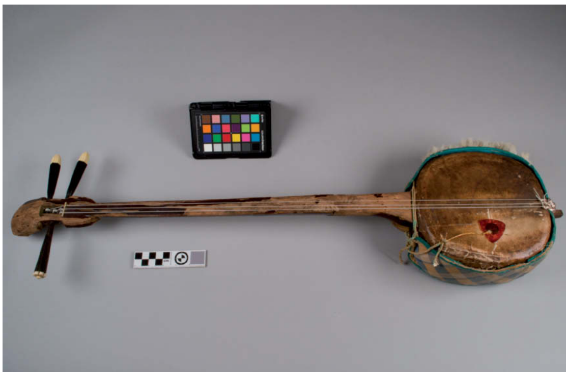
Fig. 7. Sanshin B , before treatment. Artist Unknown, Okinawan Sanshin, early 20th century, wood, leather, lacquer, textile, fur, metal, bone, plastic, 79 × 20 × 8 cm, Yomitan Museum of History and Folklore, no accession number