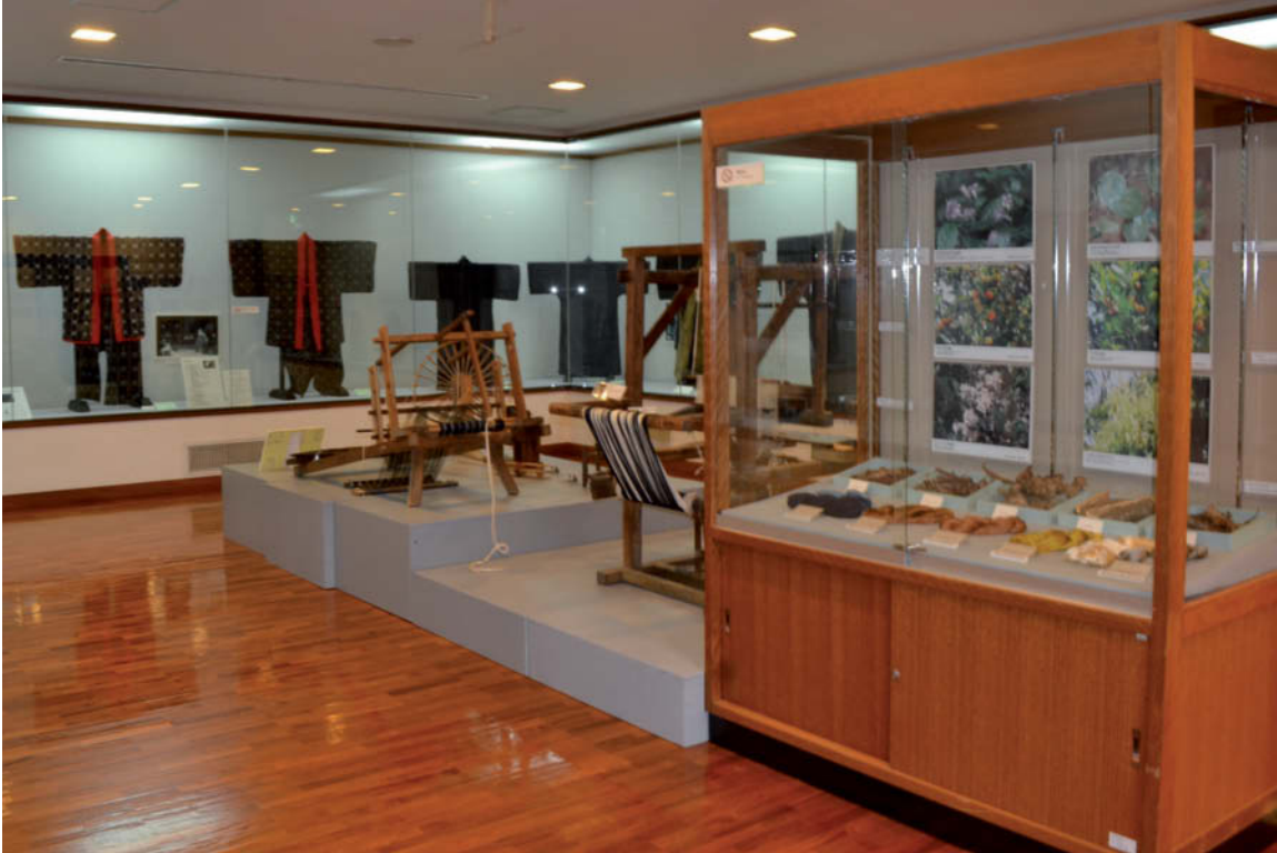
Fig. 3. Textile gallery at the Yomitan Museum displaying Yuntanza Hanauri fabric kimonos, weaving equipment, and textile raw materials

Textiles are also a strength of the collection, such as kimonos made from locally woven Yuntanza Hanauri fabric (fig. 3). The focus of the collaboration with the Yomitan Museum is artifact conservation with associated research. To begin, I performed a condition survey of the museum's artifacts on view. This included textiles, tools, household living items, musical instruments, archaeological ceramics, and other archaeological items such as shell ornaments, stone tools, and metal coins. The survey showed that many artifacts were in need of conservation and helped in the selection of appropriate projects. The most common condition issues observed were unstable pottery joins, structural instability of organic materials from past insect damage, and flaking decorative surface layers.