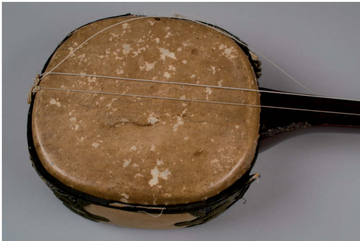
Fig. 8. Sanshin A before treatment, showing insect damage to leather covering