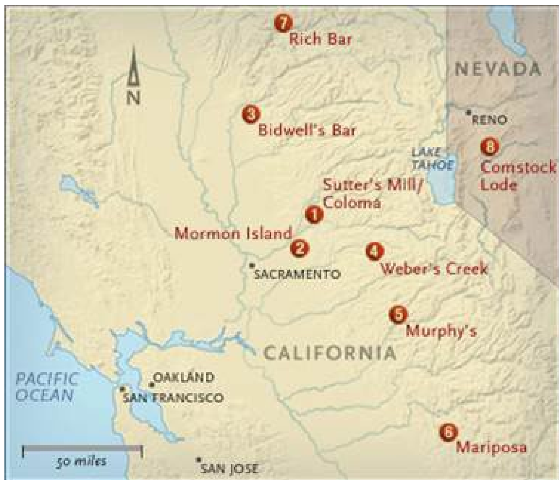
Fig. 4. Map of major mines of the California Gold Rush (1–7) and Comstock Lode (8)

Lake Tahoe is between several emigrant trails and wagon roads built to the south and north of the Lake Basin, but few fortune seekers focused on Lake Tahoe itself (Obermayr 2005). The Lake Tahoe Basin was sparsely settled by Euro-American squatters in the 1850s, before the discovery of silver in the adjacent Virginia Range. At first the squatters settled in areas that were provided for their use, near meadows with the native hay to feed cattle as in Lake Valley south of Lake Tahoe or in Glenbrook on the eastern shore (Scott 1957; Strong 1984; Hinkle and Hinkle 1987). The Washoe people took note of the squatters, as they had of the fur trappers and early immigrants, but “(f)or the most part Washo[e] life seems to have gone unchanged” (Downs 1966, 74). At this point the Washoe, their cultural practices, and their access