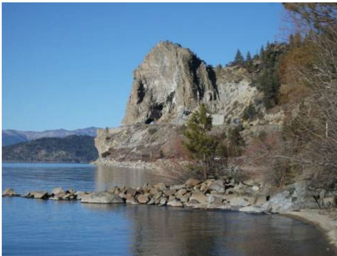
Fig. 5. Cave Rock from the South

beginning with Euro-American settlement of the Lake Tahoe Basin in the 1850s. This damage included blasting highway tunnels through the revered rock, mostly eradicating the sacred caves the Washoe Shaman used. Before becoming part of the historic Lincoln Highway (today US 50), the first “rock” transcontinental highway built in the United States, Cave Rock was part of the Bonanza Wagon Road that enabled travelers to reach the Virginia City silver mines more easily from the California gold fields. Originally the wagon road was a wooden trestle-supported bridge cantilevered over the lake side of Cave Rock (fig. 6). This structure was augmented with rock revetments to accommodate automobile traffic on the Pioneer Branch of the Lincoln Highway (Franzwa 2004).