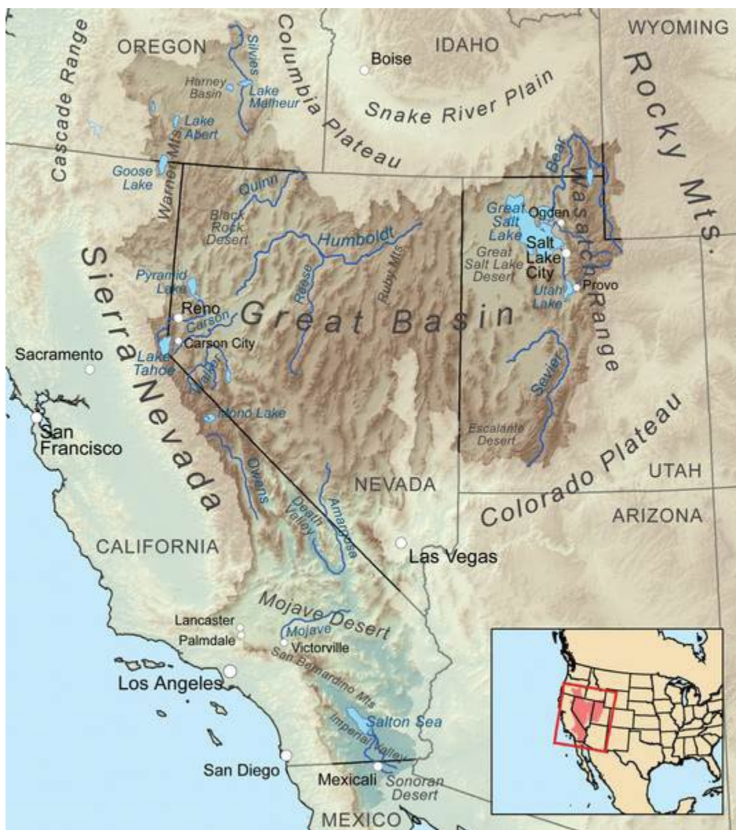
Fig. 1. Map of the Great Basin

The formation of these hybrid tourist/cultural heritage landscapes occur globally and will be explored via the landscapes of Lake Tahoe, United States (see figs. 1, 2) as these are the focus of my current research.