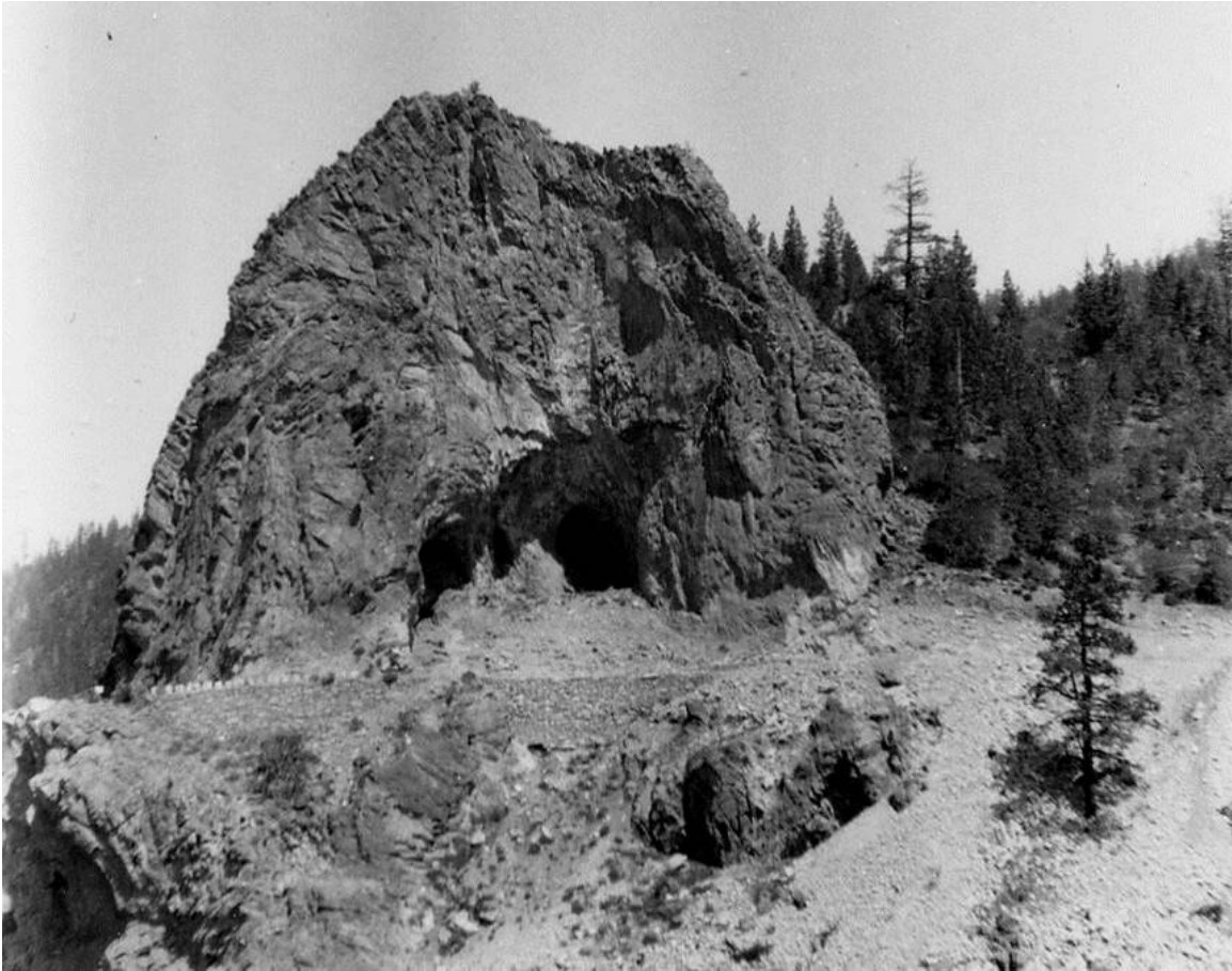
Fig. 6. Cave Rock from the south prior to tunnels ca. 1910

considered for designation as a Traditional Cultural Property on the National Register of Historic Places (NRHP). It was found eligible for inclusion in 1996 but is not yet listed. This partial victory is bittersweet. To accomplish even this, the Washoe needed a sympathetic head of the US Forest Service and had to demonstrate additional layers of significance beyond being a sacred and religious site for their people (Makley and Makley 2010). The proposed NRHP designation for Cave Rock is based on its paleoenvironmental and archeological resources, its role as a long-term historic transportation corridor, and its importance for telling the story of the Washoe People at Lake Tahoe (National Trust for Historic Preservation 2013).