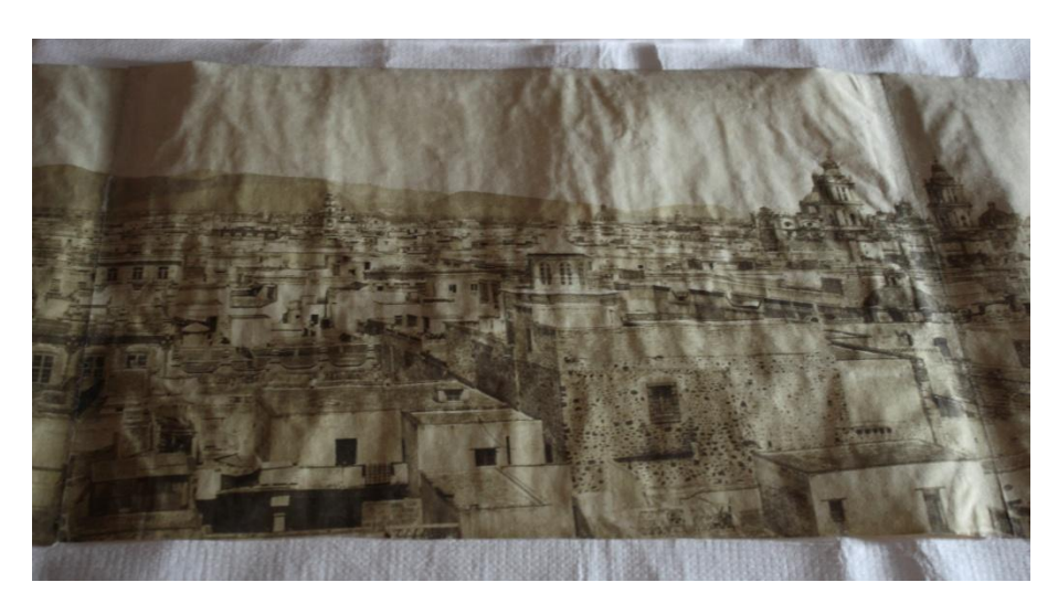
Fig 3. Detail of the new creases and distortions.

After removing the false margin, the planar distortions were corrected by humidifying with Gore-Tex and drying under blotters, non-woven polyester support and weight. Subsequently it was placed inside a polyester film sleeve, in order to hold it in place within the mounting system. Later this sleeve was attached to a 4ply cardboard. On the verso of the acid free cardboard, a dibond backing was used to give better support to the mounting system, and instead of glass, acrylic was used in order to protect the recto. The system was sealed along the edges with aluminum tape and a frame was added to support the mounting system, to ease the handling and avoid any planar distortion.