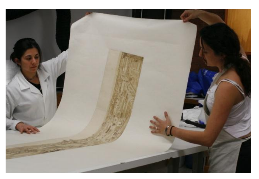
Fig 2. False margin mounting technique.

In this way, a continuous panorama was obtained, to which a false margin was applied to the borders of the verso using Japanese paper adhesive with 8% Klucel.